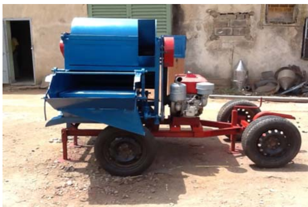
Plate 1: ASI Thresher