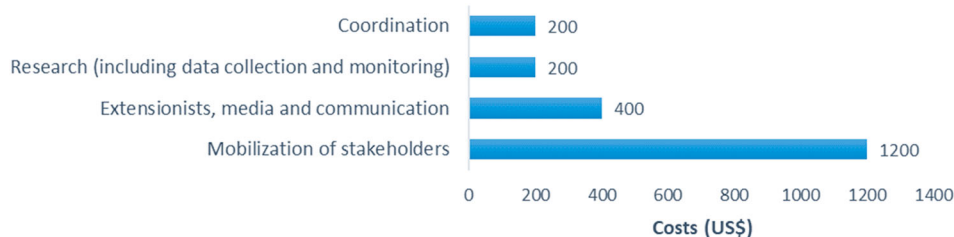
Figure 3: Distribution of costs sustained by NARO against BXW, 2012 - 2015 (US$'000).

Overall, stakeholder interviews revealed the trend of investments that occurred in the past 10 years, wherein multilateral organizations and private companies and foundations played a great role, especially during the first peak. However, the effort carried out by the