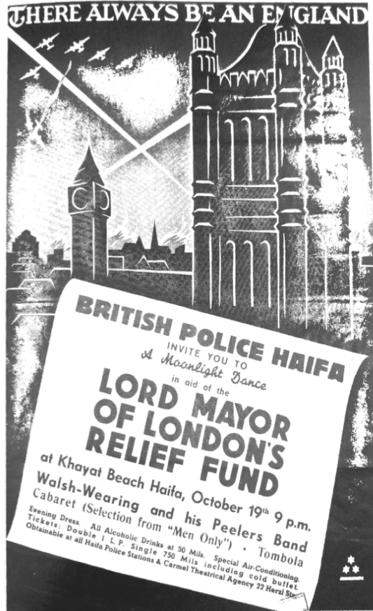
British Police poster advertising a dance in aid of Lord Mayor of London's Relief Fund for victims of the Blitz, Haifa, 1940