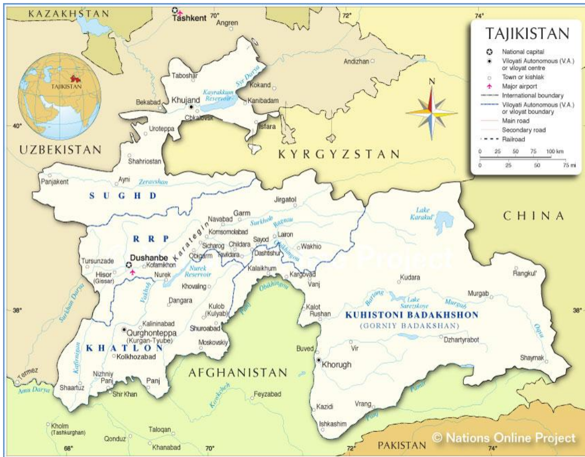
Figure 2 Map of Tajikistan

Gharmis and Pamiris remained as one of the minority population and were given the status of immigrants in that region. Because of their ethnic distinction many of the Gharmis and Pamiris became a target during the civil war and southwestern Tajikistan became one of the places of greatest violence outside of Dushanbe (Mclean & Greene, 1998).