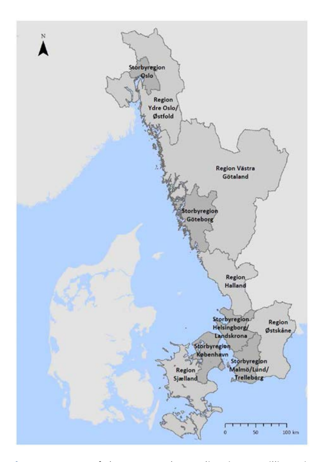
Figure 1. Map of the proposed Scandinavian 8 Million City and its 10 administrative regions.

The Scandinavian 8 Million City project was initially set up as a collaboration between the Swedish Ministry of Affairs and representatives from the other Scandinavian countries. Hence, the project was mainly a top-down initiative. From 2008 onward, the project was run by regional and local planners and officials, with the lead partners being Oslo Teknopol, a regional development agency established by the municipality of Oslo, Akershus