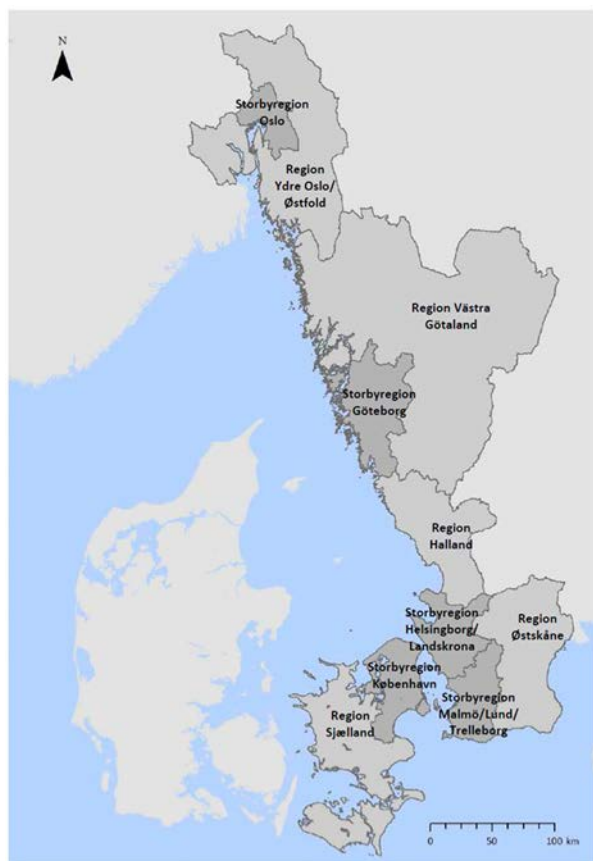
Figure 1. Map of the proposed Scandinavian 8 Million City and its 10 administrative regions.

Part of the logic for territorial competitiveness was the idea of regional enlargement to enhance regional competitiveness, for example, regional servants and politicians promoting the region-building process held that their own regions and cities were too small and peripheral to compete on a global arena. For example, the importance of connecting the northern parts of the region with Northern Europe was a clear aim for the smaller Oslo–Gothenburg region because they had a more peripheral position or were ‘geographically marginal’ relative to both the larger region and Europe.