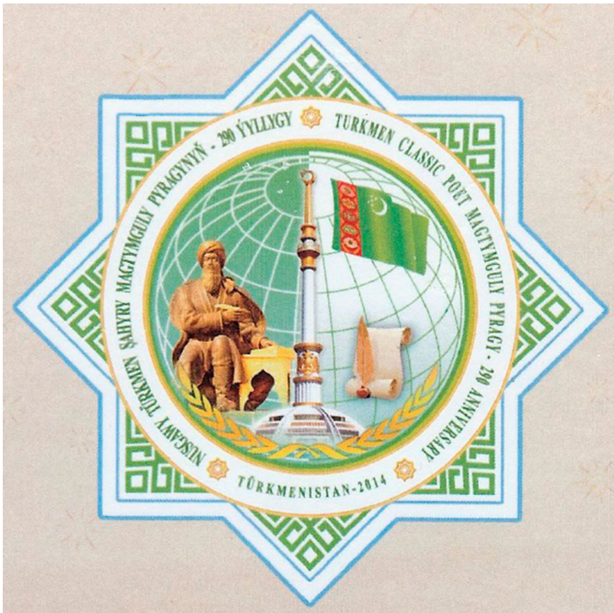
Figure 3. Year of Magtymguly seal of the government of Turkmenistan.

A special seal for the 2014 Year of Magtymguly celebration was developed (Figure 3), appearing on numerous 2014 government publications, at placards prominently displayed for conferences or exhibitions, and on banners widely seen along the streets of Ashgabat