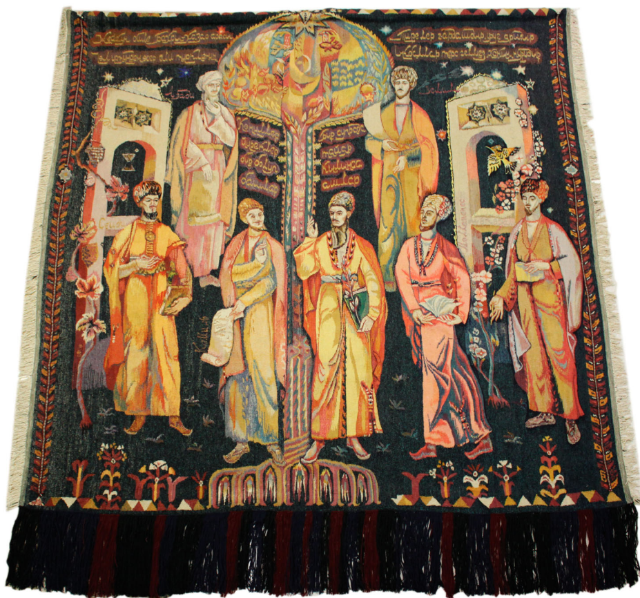
Figure 1. Constellation ( Ýedigün ). Vera Gylliyeva (1938–). Woven 1982–1985. Wool and cotton, gobelin flat-weaving. 440 × 365 cm. Registry number: AHS-938 KEK-9369.

Magtymguly Pyragy stands at the right of the base of the tree, apparently reciting poetry. At the top of the gobelin and along the tree is a poem written in Cyrillic script that has been stylized to appear Arabic, the script used for the Turkmen language at the time when Magtymguly originally wrote his poems. The two lines shown can be translated as: "When souls, hearts, and minds of tribes are united/When Turkmen gather around one table to share a meal." 8 In fact, however, only these two lines summarize the four-line stanza of the well-known original poem, 9 which presented