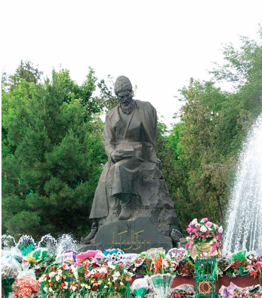
Figure 2. Statue of Magtymguly, with floral decorations placed for the “Days of Magtymguly Poetry” celebrations (May 2013) (from Taylor 2014a, 5). Sculptors: V.N. Vysotin and V.G. Kutumov; design by V.V. Popov. Statue erected in May 1971 on Magtymguly Shayoly Street in Ashgabat, Turkmenistan. Basalt. Inscription on base of statue (Turkmen in Cyrillic script) reads “Magtymguly;” Cyrillic letters have been modified to appear similar to Turkmen written in Arabic script of the kind Magtymguly would have used.

The most visible events scheduled for the jubilee in 2014 were to be held in May to coincide with the 18 May official holiday in celebration of Magtymguly’s poetry (Day of Revival, Unity and Magtymguly’s Poetry), and the day in 1992 that the country’s constitution had been signed. The result is a confluence of celebrations and headlines that, though quite logical in Turkmen, may seem anomalous translated into English, such as “Turkmenistan Celebrates the Constitution Day and Day of Revival, Unity, and Magtymguly’s Poetry” (State News Agency of Turkmenistan 2013). Collectively this holiday is, therefore, one of the more important events of patriotism and nation-building within the Turkmen calendar and emphasizes the importance ascribed to Magtymguly as a political symbol of unity in twenty-first century Turkmenistan.