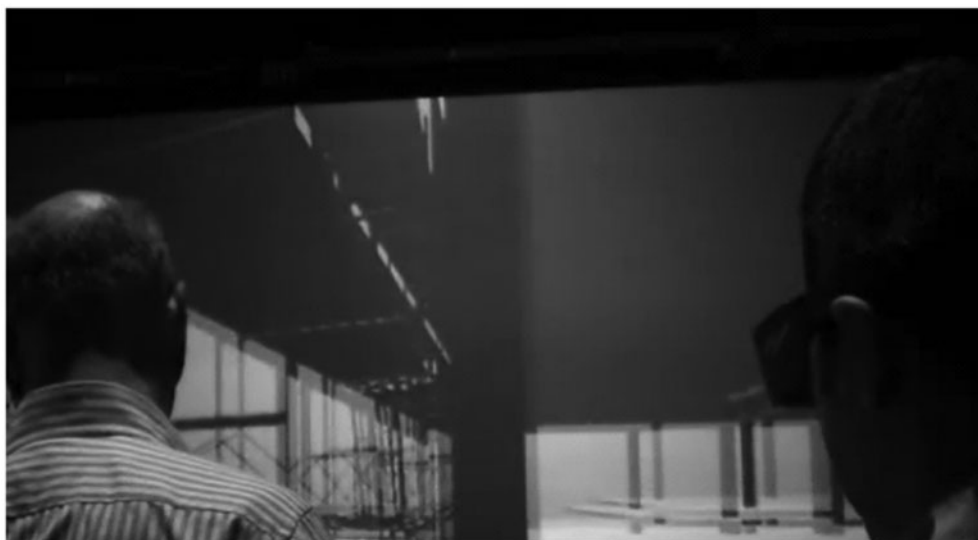
Figure 1 Safety professionals inspecting a scaffolding scenario in the CAVE

A high-rise residential project was chosen for the virtual construction site because a large proportion of the recorded accidents are falls from height or involve