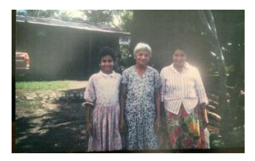
Figure 8. This picture shows my Grandmother, my great-Grandmother and me in front of our house. In the background to the top middle of the picture there is a green and white sign, which identifies Honduran Family Planning. This sign was nailed to our house as a way to let others know it was a distribution center.

I participated indirectly, by traveling with her to workshops and meetings. I met new people that I would not have been able to know. I also became educated about the root of the problems the community was facing, and learned about what I could to create change.