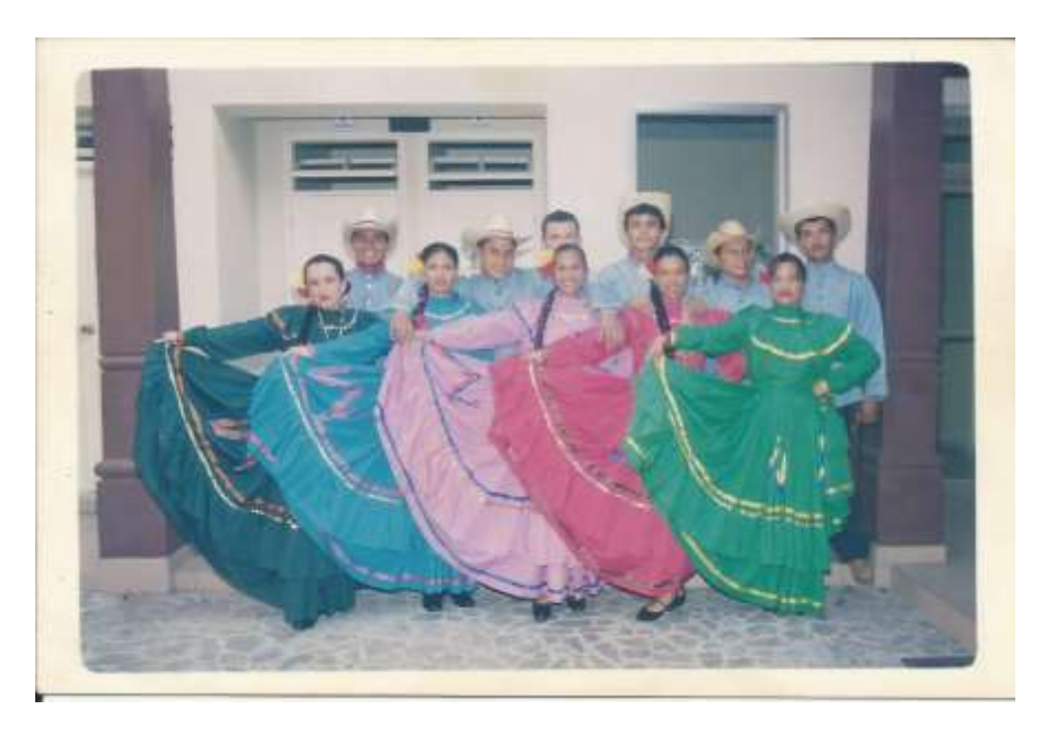
Figure 1. A trenza as a metaphor. This is a picture taken when I participated as a dancer for the Folklore Dance group at the Universidad Pedagógica Francisco Morazán (UPNFM). I am pictured wearing the purple dress. The trenza was an imperative symbol that represented our Honduran identities.

In the Honduran culture, a trenza is an inherently feminine symbol of our ancestry, beauty and strength, and perhaps of compliance that dictates of an older generation. In the dance troupe from the UPNFM, all young women wore them in a specific way to symbolize tradition, norms and beauty that also represented personal expression, and pride. The process of braiding hair is reminiscent of strength in numbers and of unification.