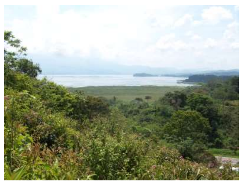
Figure 3 . Picture of Lake Yojoa. I took this picture sitting on my grandparents' land, and it indicates the distance from my grandparents' property to the water.

Figures 2 and 3 show that on one side of the highway there are highlands (right side), and on the other side the beautiful Lago de Yojoa [Lake Yojoa] (see Figure 3 )—as Williams (1957) described it "perhaps the most beautiful one in Central America" (p. 250). Our house was built in the highlands' side, but it was built so low that we never had a view of the lake, unless we climbed up the big hill behind our house. This was similar to everything that happened in our town: in order to accomplish something, we had to work hard to get it, but even working hard, it did not assure us of success. It always seemed that success was right there, but difficult to acquire.