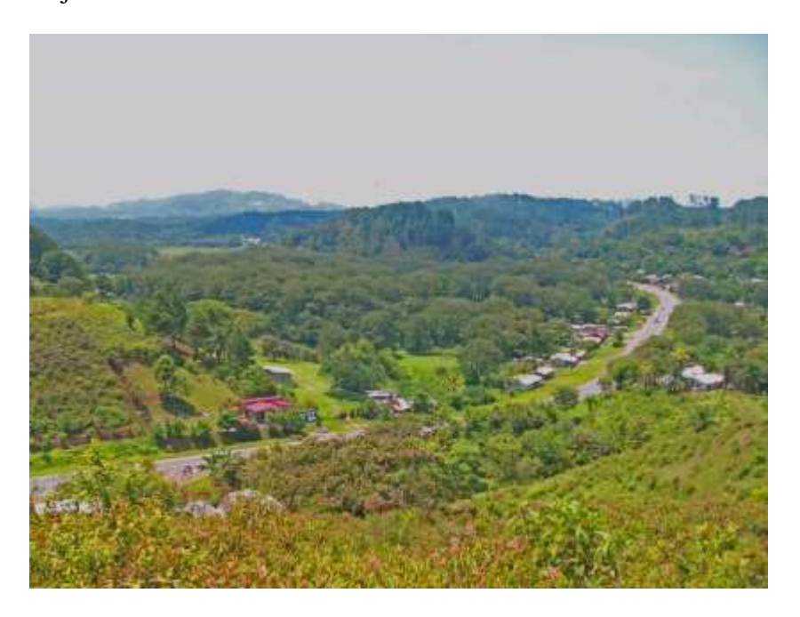
Figure 2. Picture of La Guama with the Pan-American Highway going north. I took this picture sitting on my grandparents' land. The highway divides the lake from the highlands on the right side of the highway.

the village continues to be divided by the Pan-American Highway that comes from Guatemala and goes to Nicaragua. It is no longer a dirt road; it is a paved highway that continues to carry the dreams of its adjacent habitants.