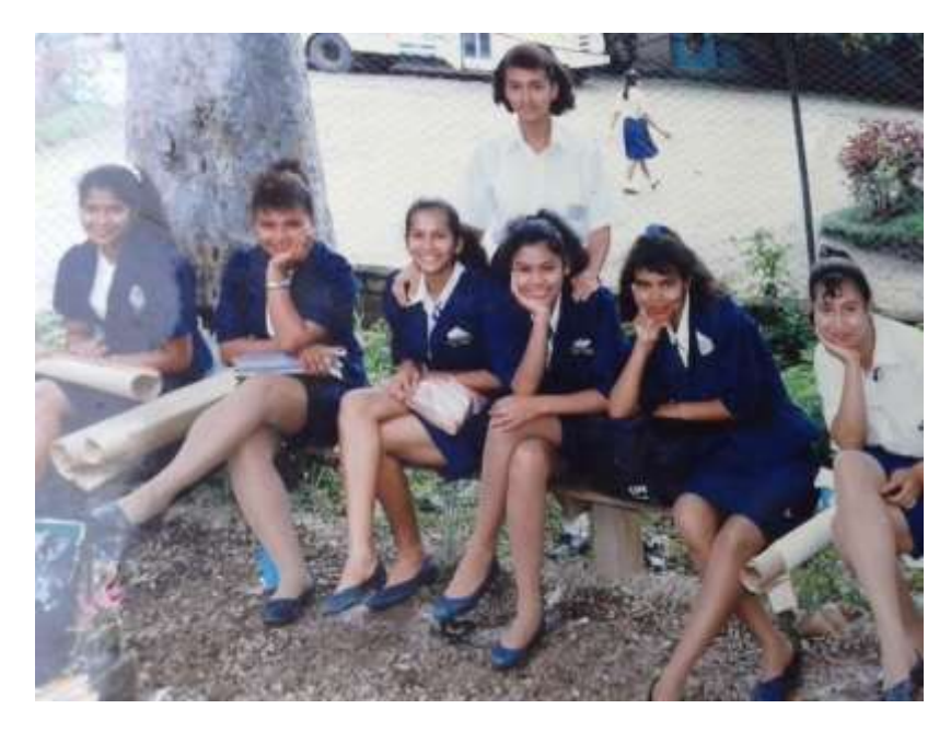
Figure 4. Las Normalistas. This picture was taken in 1996. I am sitting in the bench, third from the left, in front of the school. This was my second year cohort. We are wearing formal blue uniforms that were required if we were doing a practicum in the local schools.

listen, and think of how I was going to tell my Grandmother that if I was accepted in the school farther away, I was going to go there.