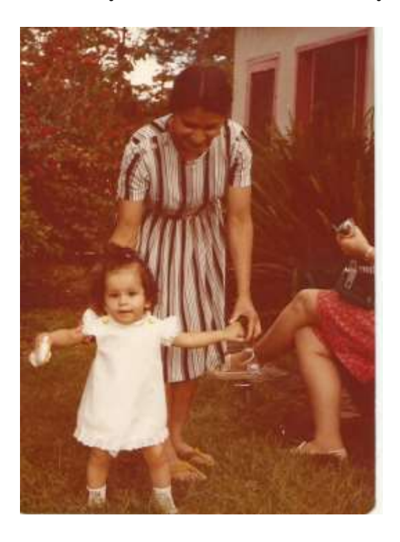
Figure 7. My Grandmother and me in 1978 at the Biblical Institute.

I designed this question with the purpose of discovering my journey as a feminist woman in Honduras. The question arose from my own doubts that my Grandmother had any influence on that development. In fact, I initially believed that my feminist growth was a result of Western academia, and not from lived experiences in Honduras. To my surprise, this study demonstrated the contrary. The picture that I am sharing above encompasses the relationship I developed with my Grandmother. As long as I can remember, she has always been part of my life. Any movement she was part of I also participated in. I watched, learned, shared her knowledge, and became an active participant. She continuously aspired toward a better community and her relationship with it was always deep.