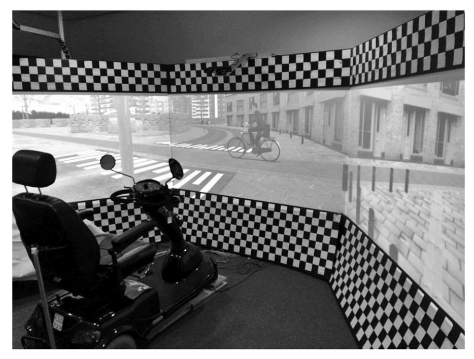
Figure 1. The mobility scooter simulator accompanied by rest-frame.

voluntary basis. The experiment was approved by the Ethical Committee Psychology of the University of Groningen, the Netherlands, according to the Declaration of Helsinki. All participants provided written informed consent.