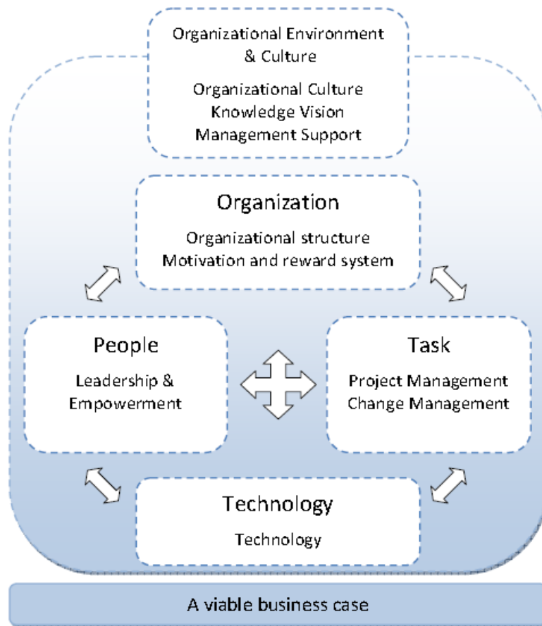
Fig 2.2 Theoretical foundation for the analysis of any business case

The model (Figure.2) below provides the theoretical foundation facilitating the analysis and understanding of any business case.