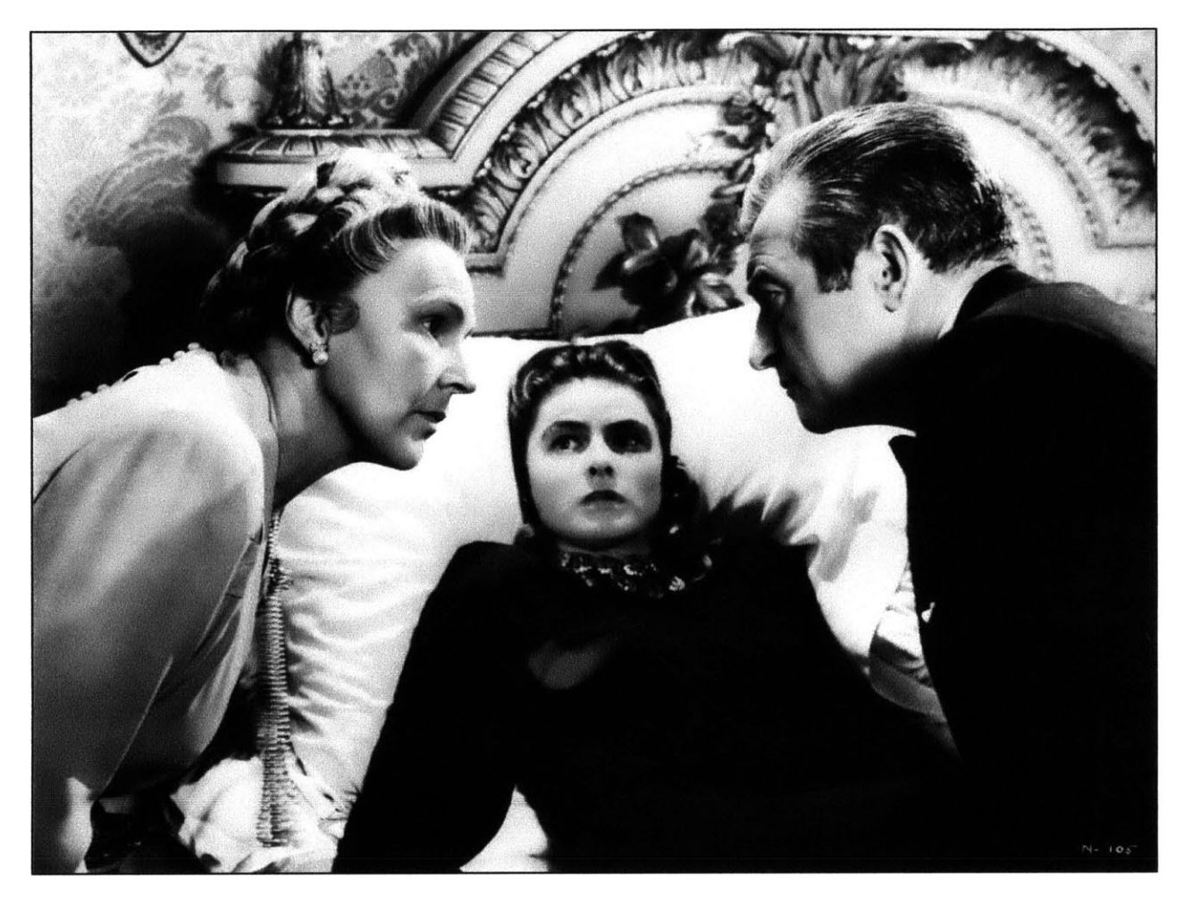
Figure 1 Notorious publicity still N. 105, MGM Studios, 1946.