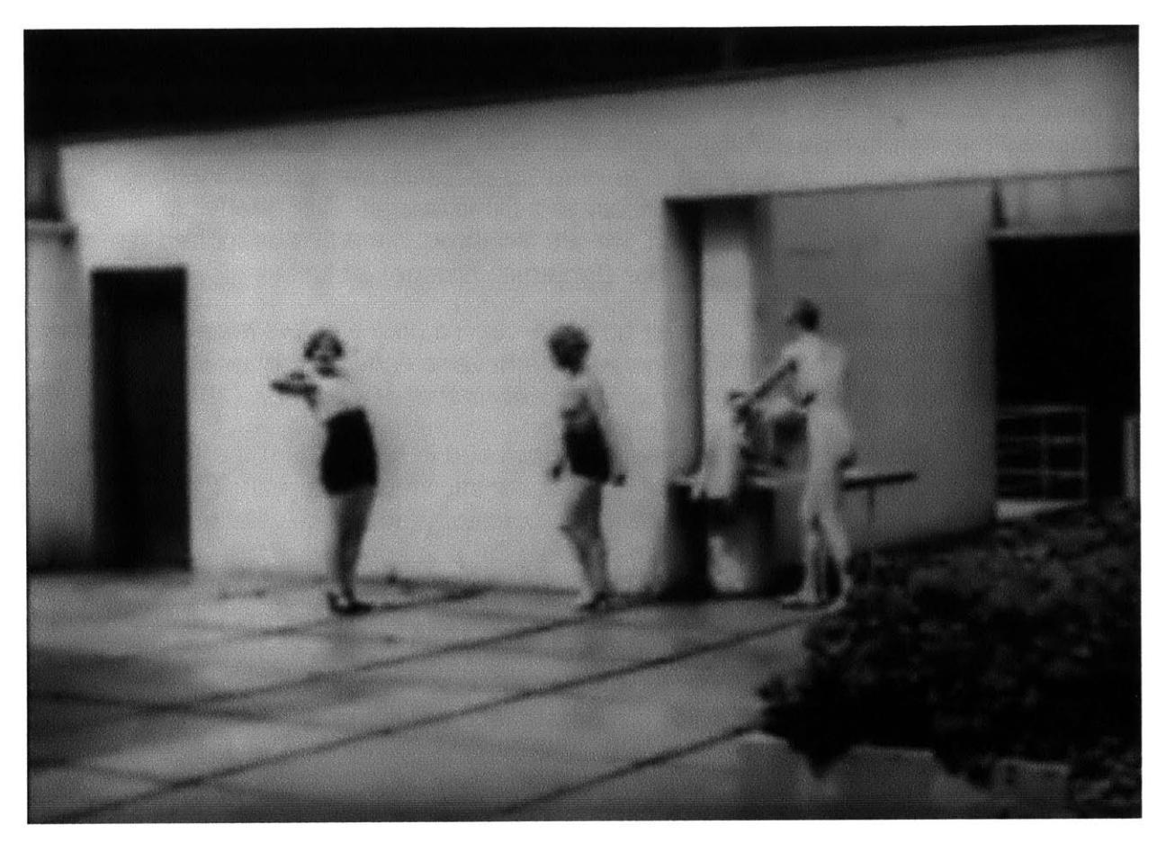
Figure 5 Still, L'Architecture d'aujourd'hui, dir. Pierre Chenal, 1929

the representation of the dominant ideology, Colomina's focused description implies that L'Architecture d'aujourd'hui is indicative only of that which it seeks to represent—Le Corbusier's architecture—and is emblematic in doing so.