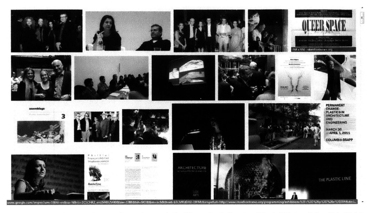
Figure 7 Google Image Search result for "Beatriz Colomina Mark Wigley." April 7, 2013.

The timing of the project's inception—late 1992—corresponds with the publication date of Sexuality & Space ; moreover, the language of the selection above, in particular the phrase "the role of space in questions of sexuality" resonates with Colomina's phrase, in the introduction to Sexuality & Space , "the question of 'Sexuality and Space'." For reasons that remain unexplained, the "Queer Space project" rapidly became something different from what Colomina expected, and I don't think that she was all that happy about this. As Colomina writes, "Even before the first meeting, the focus became queer space. I don't think that any of us quite realized what we were getting in to [sic]." Considered with the reference to the event as "The Queer Space project" rather than with the title, "Queer Space," this comment implies a level of derision, if not frustration, hidden behind a scrim of professional courtesy. That this should be so is accentuated by the exasperation implied by Colomina's ambiguous and ambivalent concluding description of the exhibit/event: