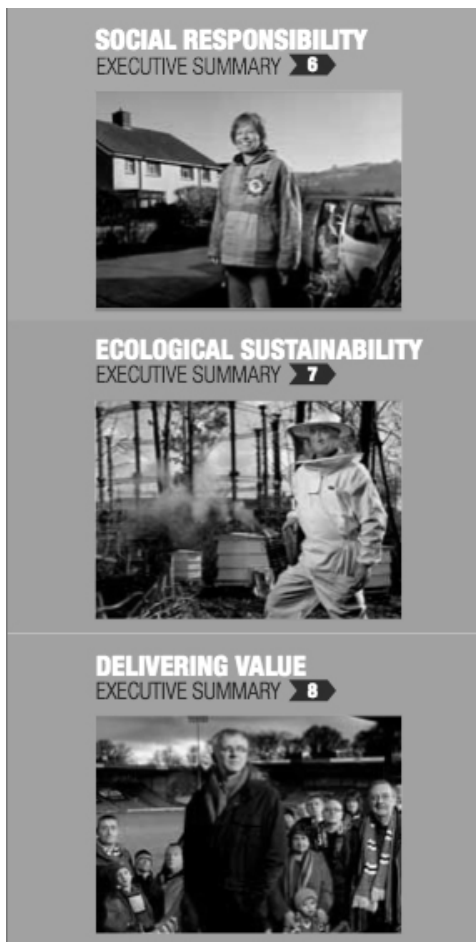
Figure 9. Environmental portrait examples from Co-operative Sustainability 2011.

company's global week of corporate responsibility and sustainability activities. Although the photo itself poses technical challenges, such as over exposure, poor composition and focus issues, it's a representation of real people taking part in a real event. The moment captures subjects in action working together as they drag materials across the school grounds. The staggered and partially obstructed bodies, type of clothing style, and lack of eye contact with the camera suggests they were not instructed to pose for this photograph. The image provides the viewer with a sense of place and proof of true interaction between Coca-Cola and the community it serves. The presence of caption information provides further detail about of the event, and lends evidence that Coca-Cola is doing what they claim to be doing in their CSR efforts.