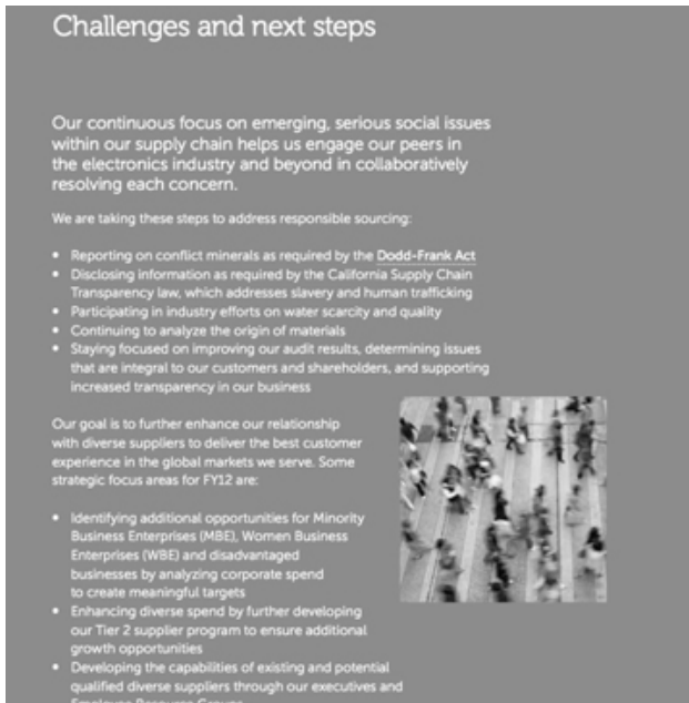
Figure 5. The Dell CSR 2011 Report example.