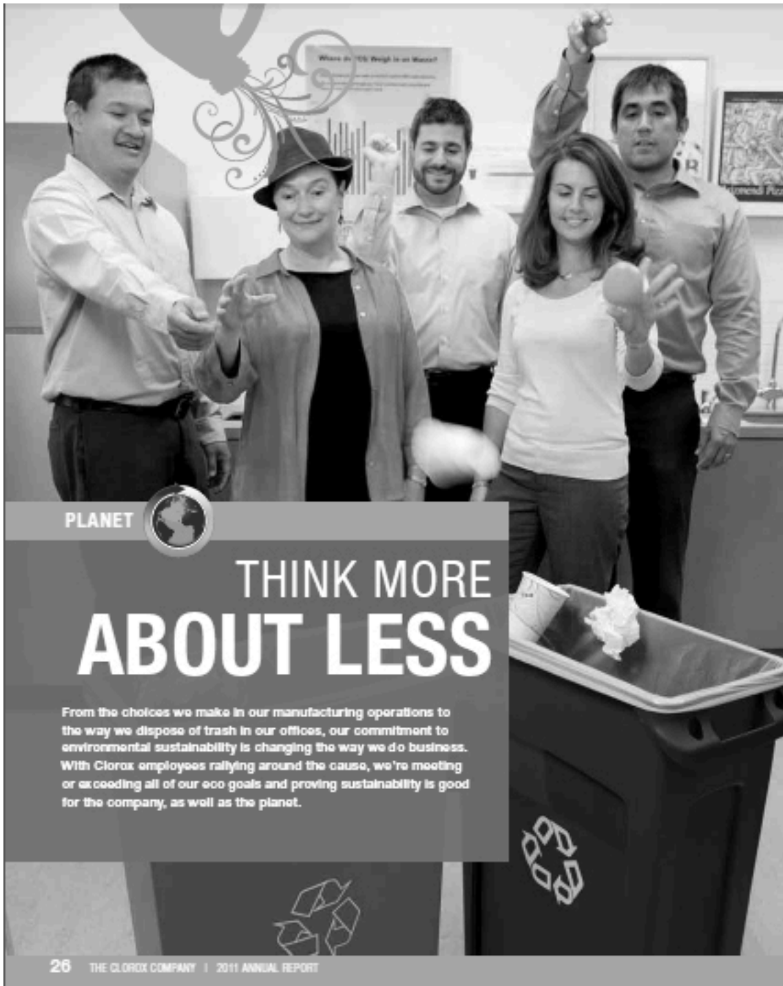
Figure 1. Photograph from the Clorox Think Outside the Bottle 2011 Annual Report.