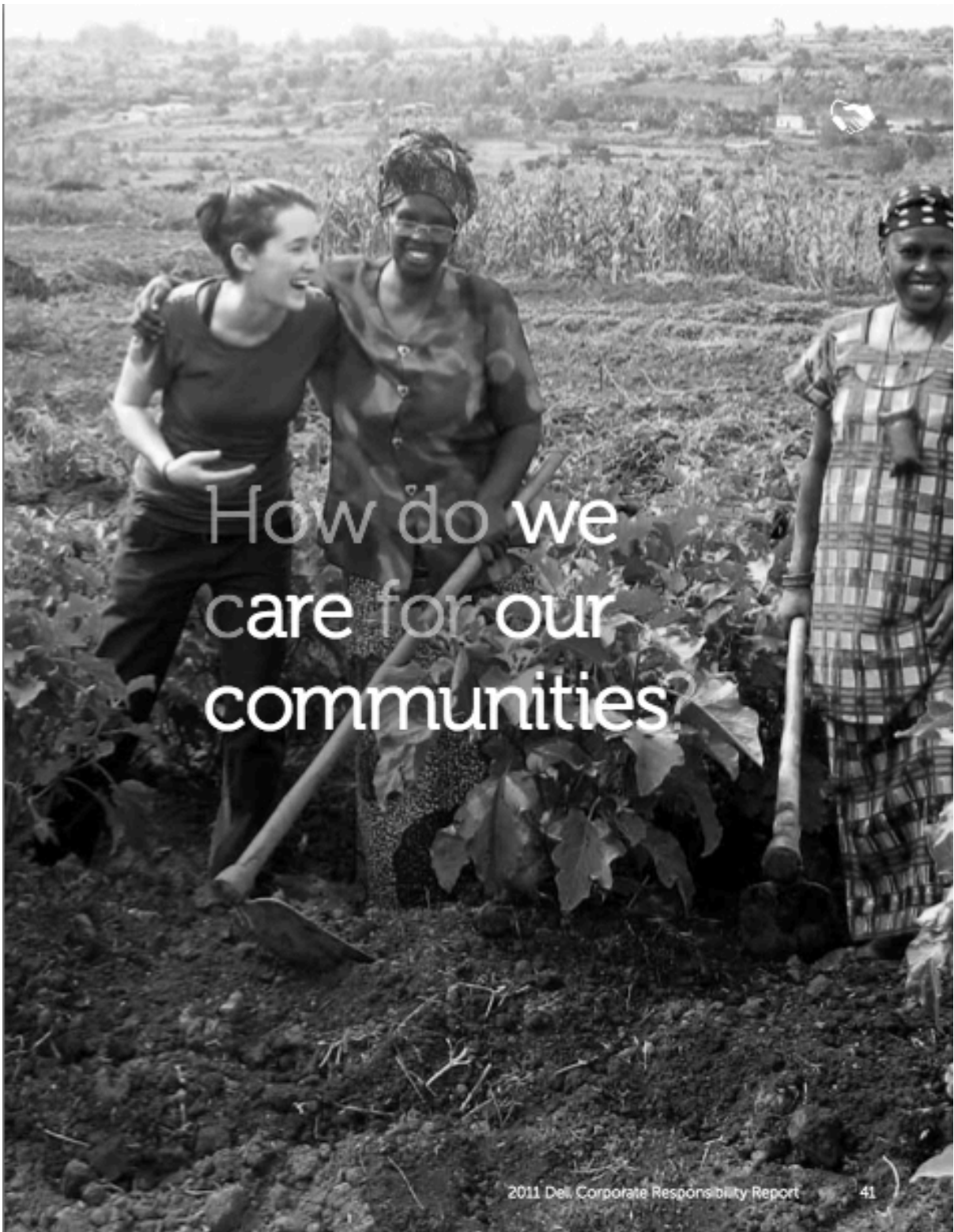
Figure 2. Photograph from the Dell CSR 2011 Report.