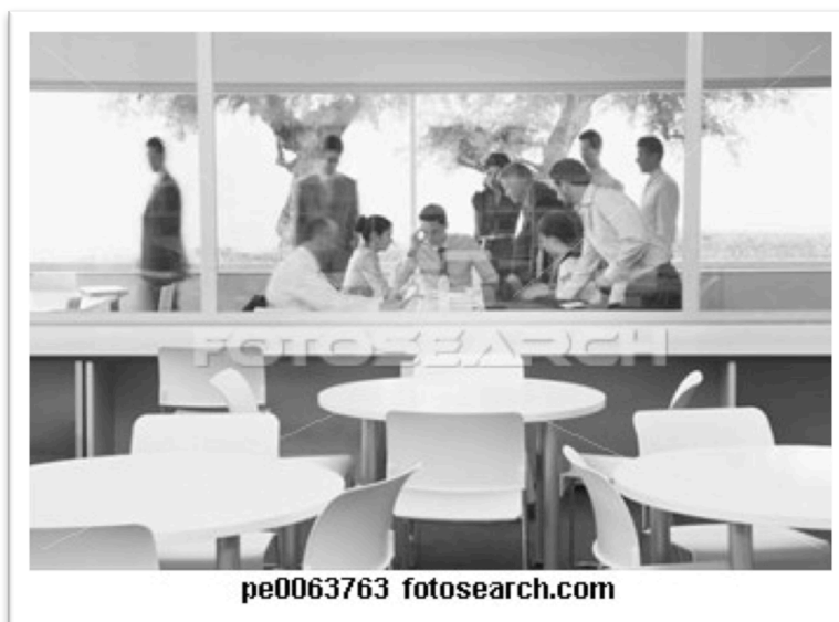
Figure 8. Dell CSR 2011 Report example.