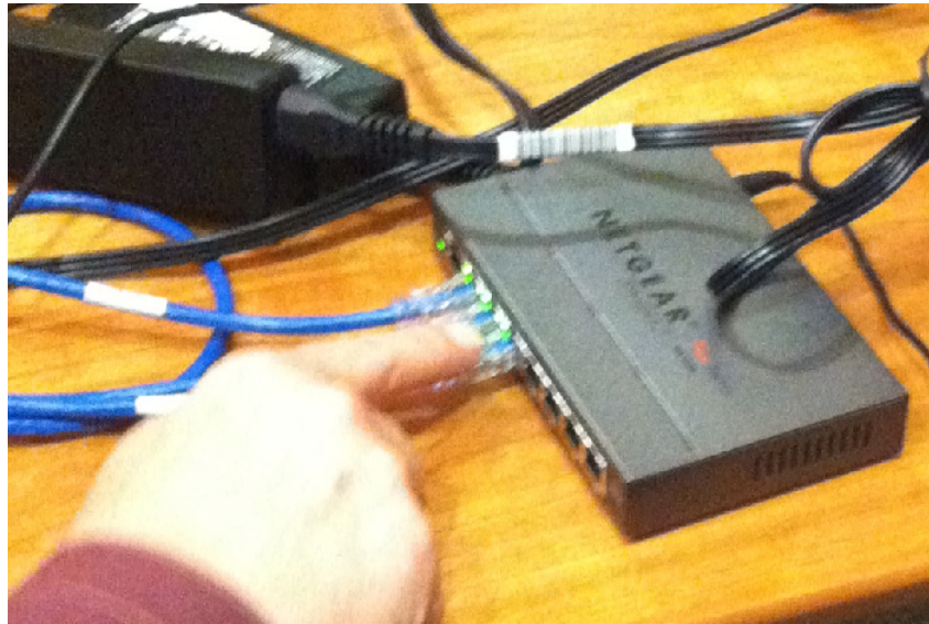
Figure 6 – The switch and cables (one cable per laptop) used to set up a Local Area Network (LAN).

capability to have multiple data enterers enter data into the same system in each country conducting exit screening in real time (see Figures 6-7). The Unit deployed two teams to Liberia and to Sierra Leone in order to first implement the Epi Info version of the database.