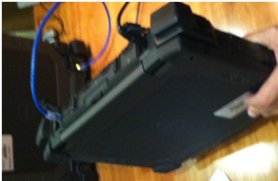
Figure 7 – One of the rugged laptops. Two rugged laptops and one high performance laptop were deployed per country.