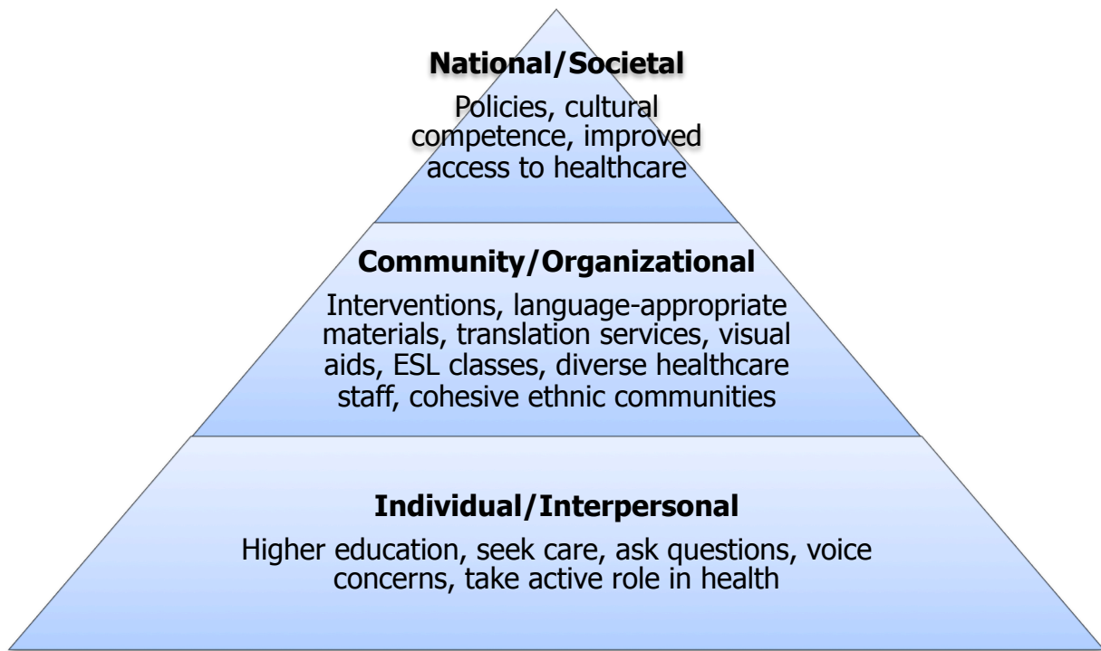
FIGURE 1: Social ecological model of interventions appropriate to LEP patients