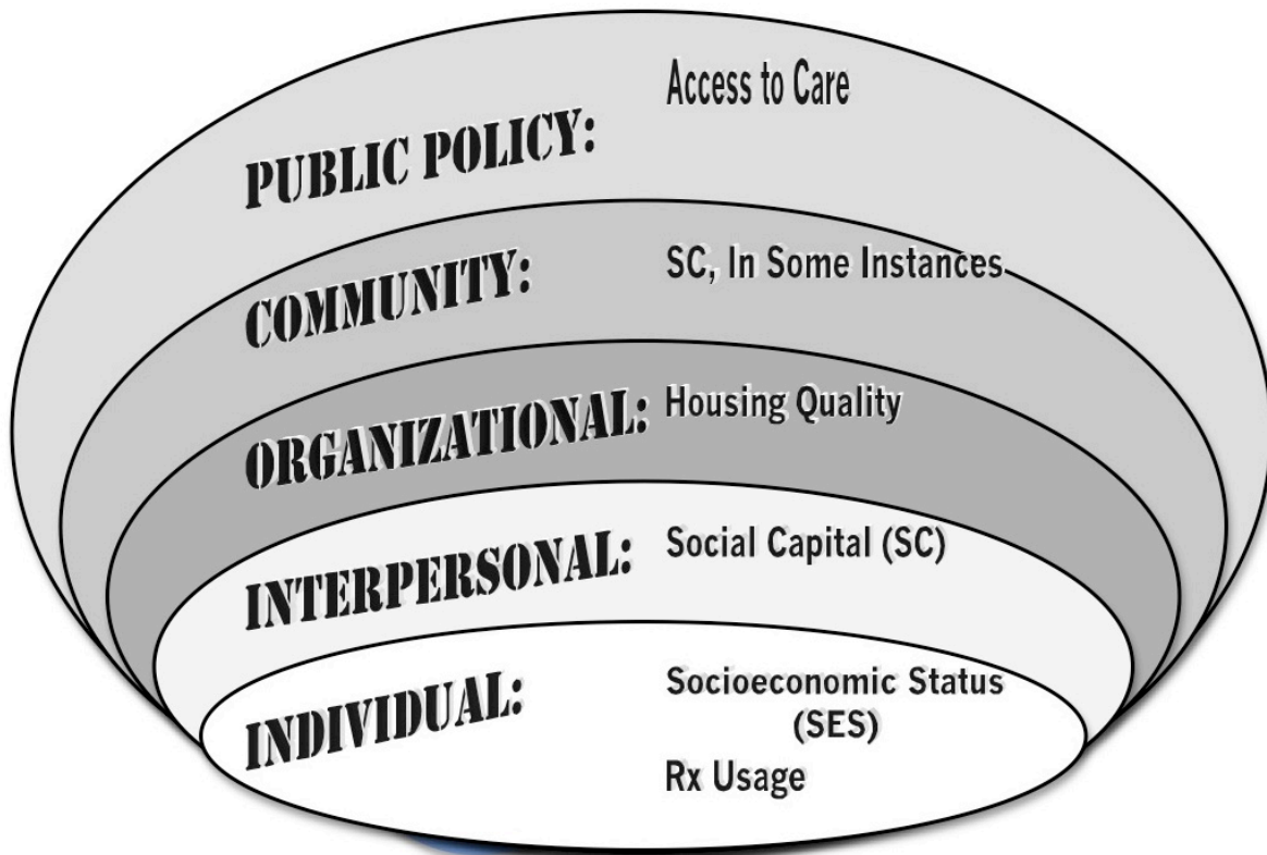
Fig. 1 – Adapted SEM