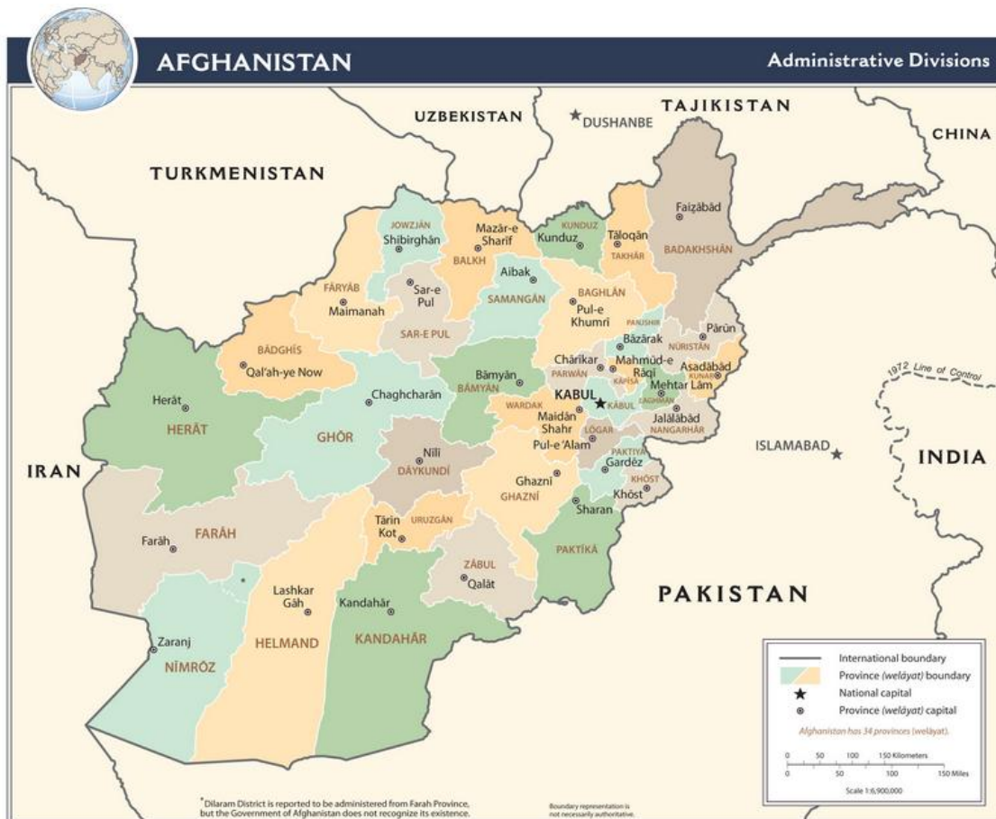
Figure 2: Afghanistan (Administrative Divisions)

The MoPH Hospital System has categorized all public hospitals into four levels of facilities; District Hospitals, Provincial Hospitals, Regional Hospitals, and National Specialty Hospitals. In each of the first three levels of hospitals, collectively called as the Essential Package of Hospital Services (EPHS), four core clinical functions exist: medicine, surgery, pediatrics, and obstetrics/gynecology. Mental health and dental health are mainly provided as