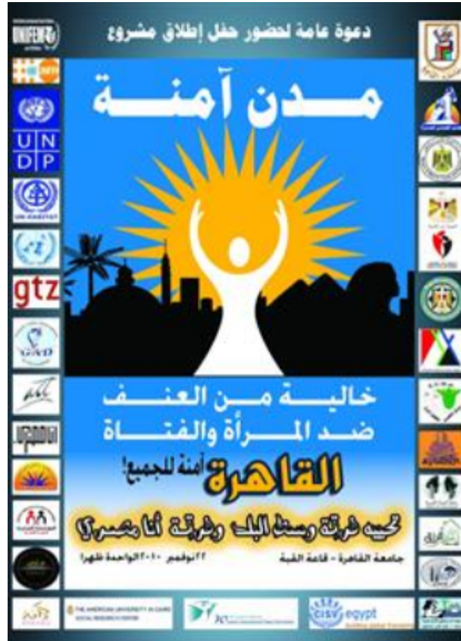
FIGURE 5: CAIRO SAFE CITIES PROJECT POSTER