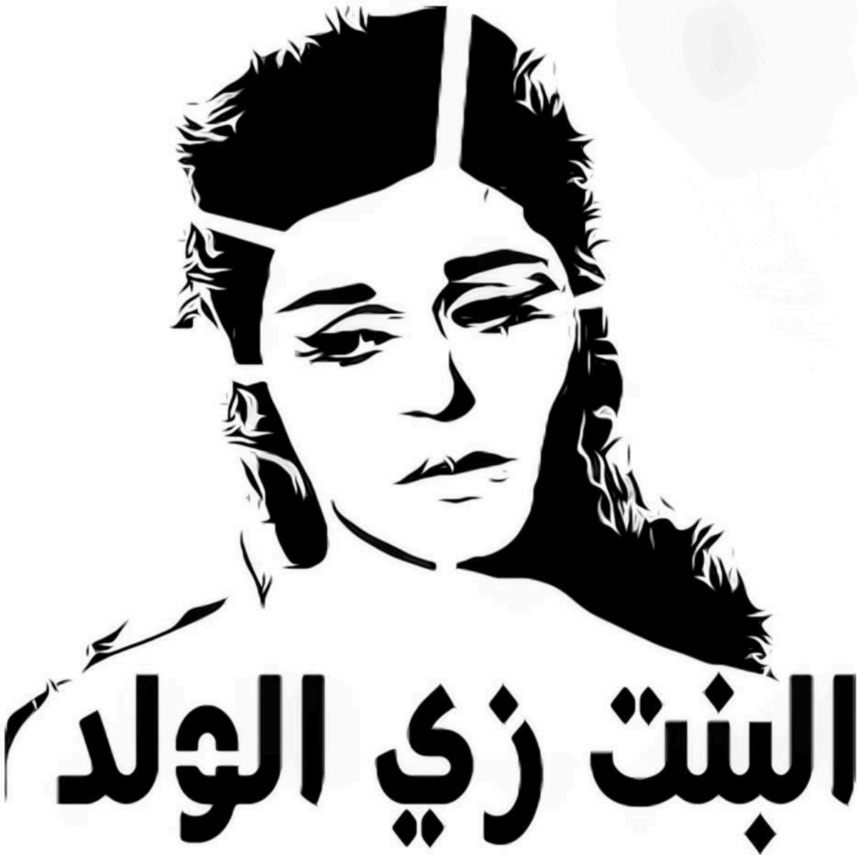
FIGURE 4: CAIRO PUBLIC GRAFFITI DEPICTING “A GIRL IS THE SAME AS A BOY”

Note: Graffiti representing Naglaa’a Fathy’s (depicted) trend setting 70’s music video 41 .