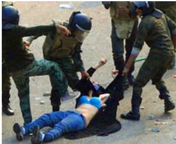
FIGURE 3: THE BLUE BRA INCIDENT IN TAHRIR SQUARE 37

Up until the January 25, 2011 Egyptian revolution, commendable achievements had been created in favor of protecting women from violence. A law had been created prosecuting perpetrators of sexual harassment both in public and private. Another law declared female genital mutilation (FGM) illegal. And most unexpected of all was a law allowing women to divorce men, contrary to the layman's understanding of Islamic jurisprudence, yet the law utilized scholarly Islamic sources for support as well as ample political will.