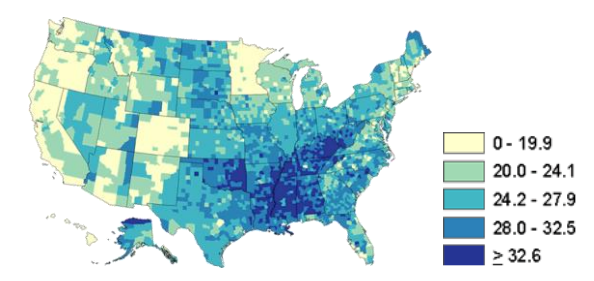
Image adapted from Centers for Disease Control and Prevention: National Diabetes Surveillance System. Available online at: <u>http://apps.nccd.cdc.gov/DDTSTRS/default.aspx</u>. Retrieved 10/4/2011