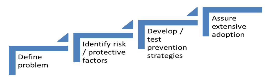
FIGURE 1 The Public Health Model (adapted from CDC, 2012)

Answers to these questions can help public health professionals advance the violence research agenda promoted by the Centers for Disease Control and Prevention (CDC) (Figure 1).