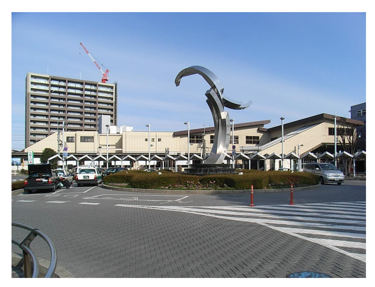
Figure 2. Honjo Station South Entrance