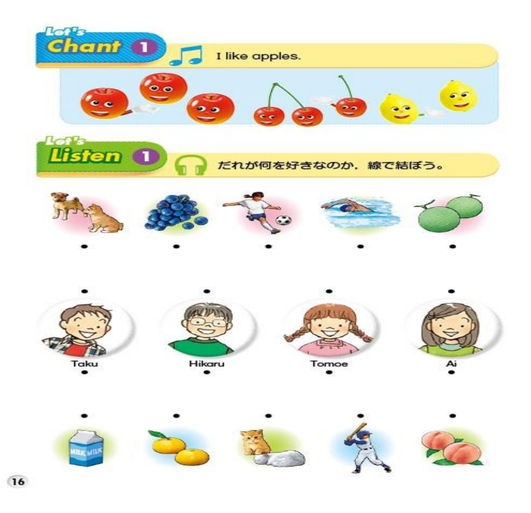
Figure 5. Hi Friends 1: "I like" activity page

basic, just requiring the students to sing "I like apples, bananas, grapes," etc... The first time I did this song they enjoyed it to a certain degree, but I decided to add designated dance moves that I assigned to each fruit. An exciting feature included in both Hi Friends books was an audio CD that had the ability to play all of the songs at slow, medium, and fast speeds. As a class we started out at the slow speed until students were comfortable with the dance moves. Then we went to medium speed, then fast. By the time we got to fast, students were having a blast because the dance moves were quite silly and trying to complete them at such a quick pace often ended in a comical chaos that everyone in the classroom enjoyed.