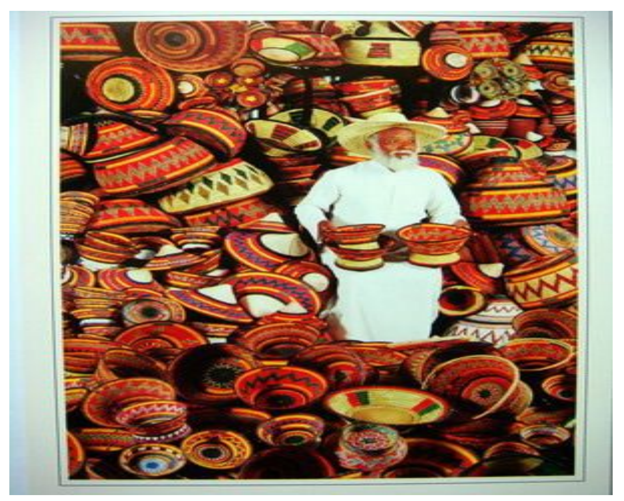
Figure 3. Baskets like those my mother made for market

... a central location for the production of a counter- hegemonic discourse" (Foss et al, p. 276). When my father died in 1986, the cultural expectations in KSA for widows with very young children was that she surrender her children to her dead husband's family in order to remarry. Historically, "Bedouins sell and barter products in order to obtain agricultural food from sedentary peoples" (Joshua Project, 2017, web), so this ancient custom seemed to come easily for my mother whose family taught her the trades.