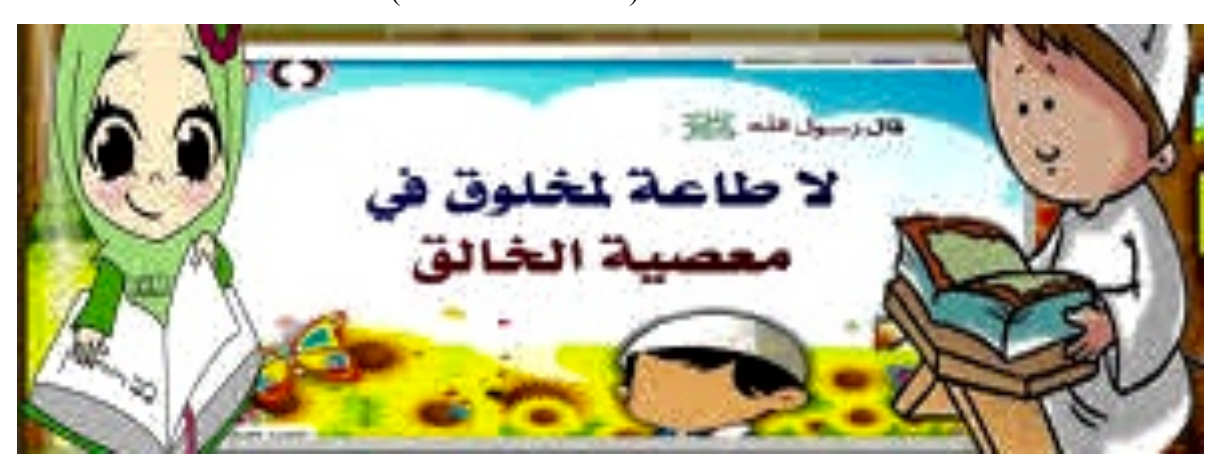
Figure 6: The prophet said, "There is no obedience to the creature in disobedience to the Creator" (Al-Emam Ahmad).

do it. When fathers ask their children to do anything, the children don't have a choice, they must do it, even if their fathers are not Muslims, unless their fathers ask them to disobey God. The prophet said, "There is no obedience to the creature in disobedience to the Creator" (Al-Emam Ahmad).