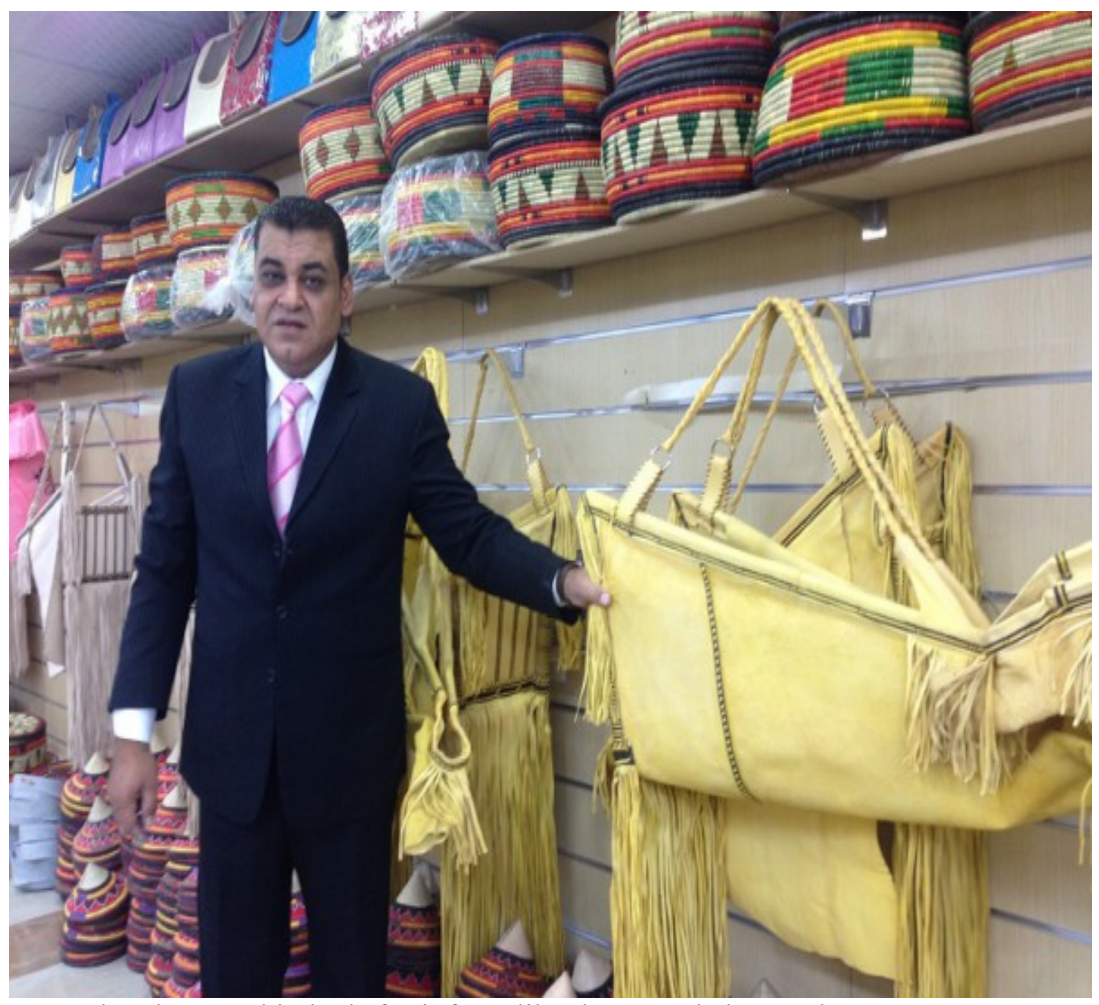
Figure 4: Handmade, goatskin beds for infants like those made by Mother

But she was not able to take the items to market to sell them. In Saudi Arabia, women are not allowed to be in public or in the market place without a male escort, and my father had died. Therefore, my uncle had to take these items to the market to sell, so we could earn more money for the family. Inside the home, my brothers and I often watched my mother making these things. She worked very, very hard so that we always had toys and other things we asked for. She was a great mom!