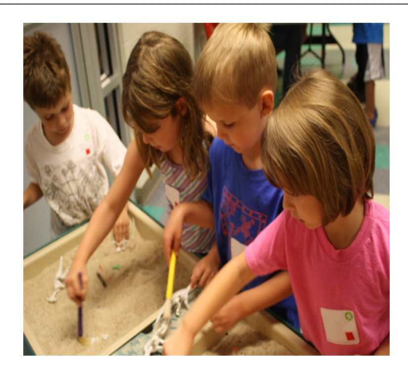
Figure 5: Students at a dig site.

discover new words and all the artifacts within their dig site—which consisted of a shoe box, half filled with sand, plastic dinosaurs, sea shells, pieces of bark and twigs. All students had their own Paleontologist journal where they would write the details of their site, directions and what items they unearthed. I would aid them, spelling some words on the board and would ask them questions about how they were discovering and documenting their outcomes.