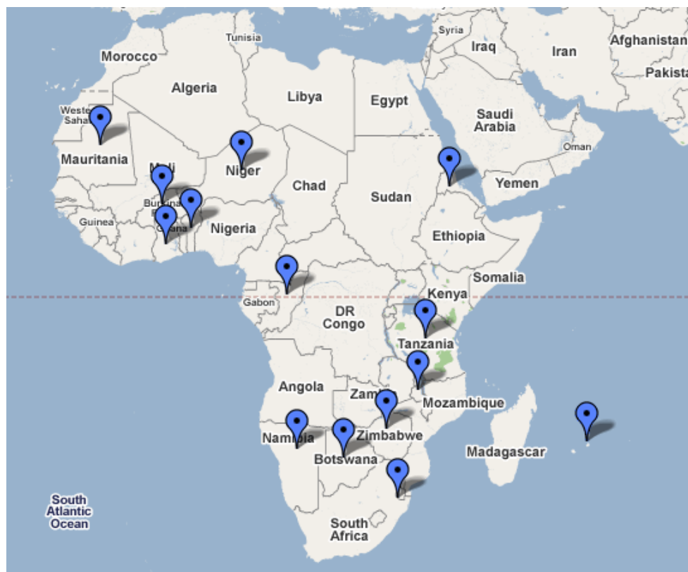
Figure 2 Map of Africa and selected countries