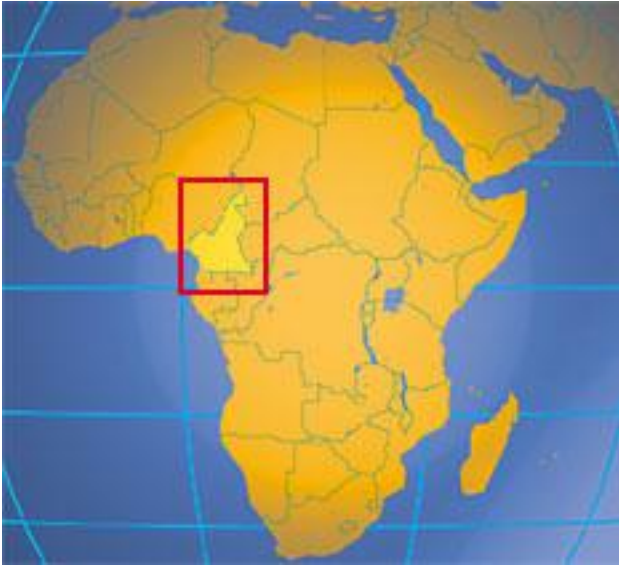
Map1: Location of Cameroon in Central Africa