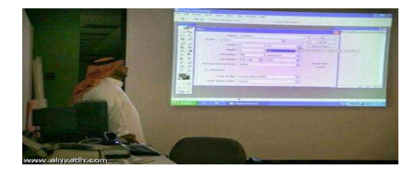
Figure 4. Media Use in the English Class in Saudi Arabia

In Figure 4, we see a Saudi English teacher who is showing his students how to use the class website to submit their assignments.