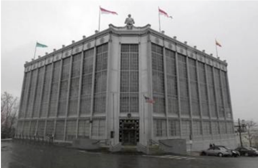
Figure 2.1: Leland's steel and glass creation, looking much the same in 2013 as in it did when first built. 13

The new building was built directly in front of Worcester Pressed Steel, linked to its parent company by a passageway and catwalk that allowed visitors to tour the museum and then view the factory itself. The upper museum floors were “arched and plastered to form a two-winged hall” that Higgins and Leland designed to resemble the Great Hall of Prince Eugene’s castle in Hohenwerfen, Austria, a sight that had greatly impressed Higgins on his European travels. 14 The two wings of the museum’s Great Hall featured “ancient” and “modern” subject matter; the former showcasing chronologically exhibited suits of armor and ancient weaponry while the later displayed pieces of modern metalwork that included automobile parts and other “crowning examples of mass production,” such as airplane parts and utensils. 15