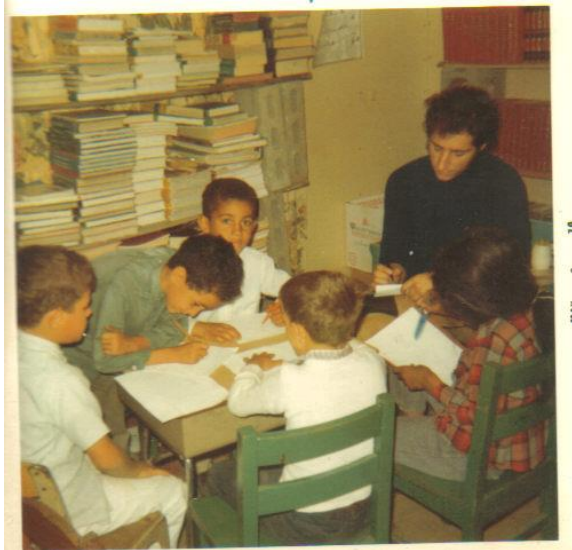
Figure 2.5 Four Holes Freedom School