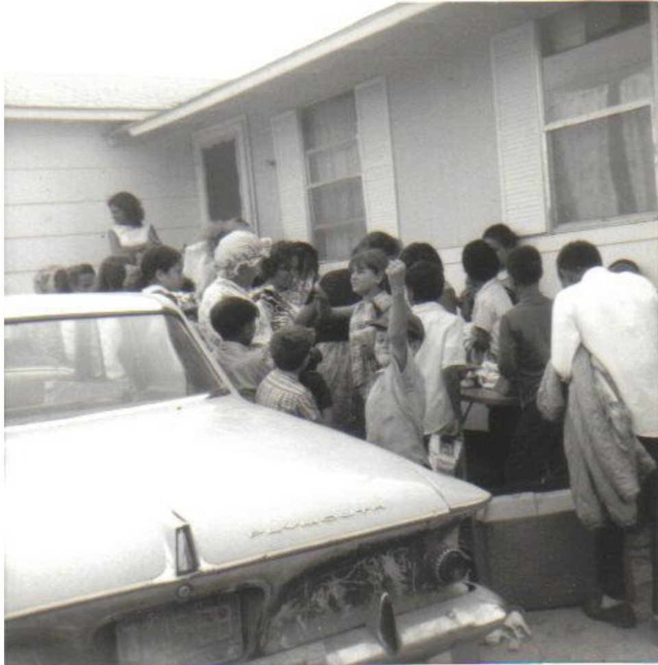
Figure 2.1 Four Holes School Children Gathered in the Four Holes Community