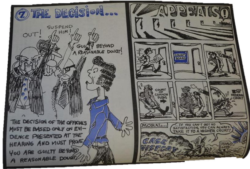
Figure 1.3 Illustration from South Carolina Handbook of Student Rights and Responsibilities

In 1975, the United States Supreme Court for the first time considered the issues arising from student discipline procedures in public schools. In Goss v. Lopez , the Court ruled that the suspensions of nine black students in Columbus, Ohio, who had been suspended for 10 days from their schools in 1971, were unconstitutional because students did not receive due process. Administrators suspended students following widespread racial tension and unrest due to the cancellation of Black History Week by school administrators, but some of the suspended students maintained they were only bystanders to demonstrations, and had done nothing wrong. At the time, the state of Ohio permitted 10 day suspensions and required no hearing procedures. By a 5-4 decision, the Court ruled that students were entitled to due process rights, even in cases of short suspensions. At the very minimum, the court said, a student "must be given some kind of notice and