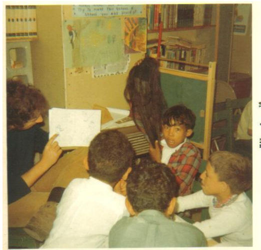
Figure 2.3 Students Learn at Four Holes Freedom School