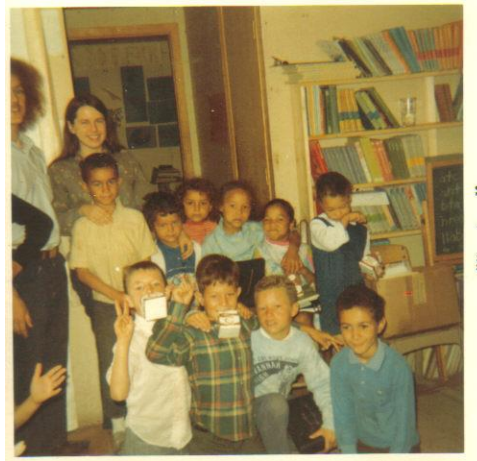
Figure 2.2 Four Holes Students Gathered at Freedom School

field experience. Volunteer students from the University of South Carolina also provided medical and dental care to many of the malnourished children. ccxxvi