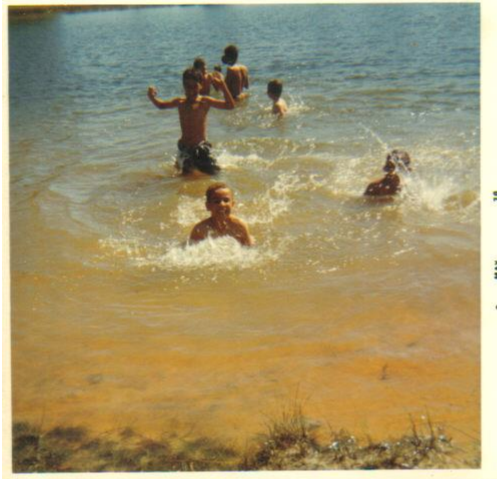
Figure 2.6 Four Holes Children Swim in Nearby Four Holes Lake