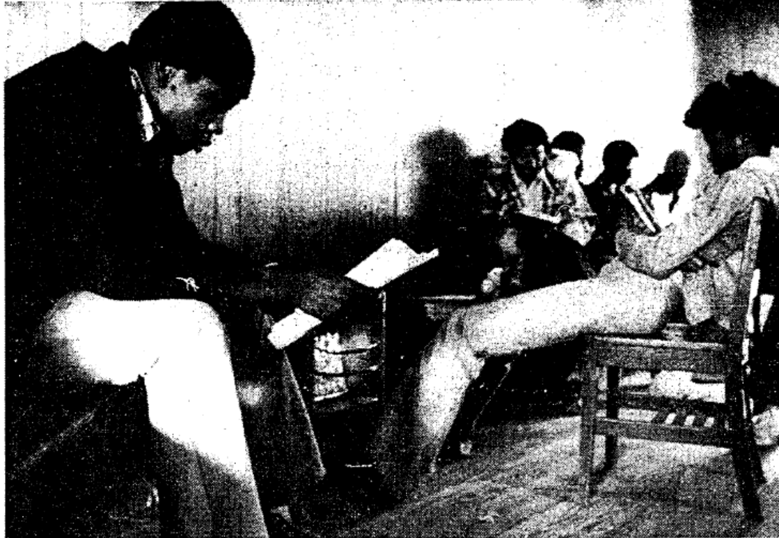
Figure 5.2 Picture of students studying at an abandoned Masonic Lodge in Calhoun County during the boycott.