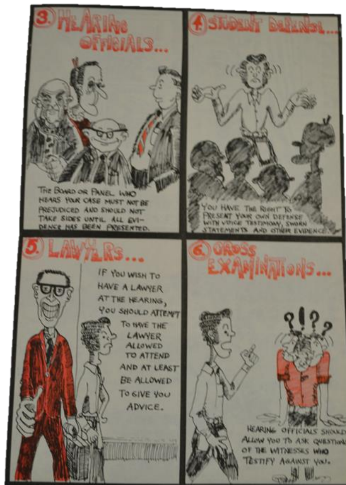
Figure 1.2 Illustration from South Carolina Handbook of Student Rights and Responsibilities