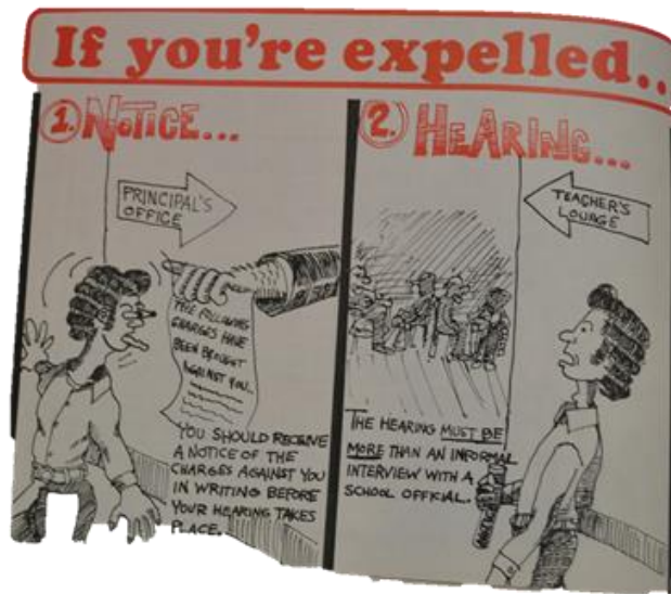
Figure 1.1 Illustration from South Carolina Handbook of Student Rights and Responsibilities

and numbers for students to call if they needed help in disciplinary procedures. Civil rights groups around the nation applauded the South Carolina student handbook and many asked Mizell to assist in creating handbooks in their own respective states. cx