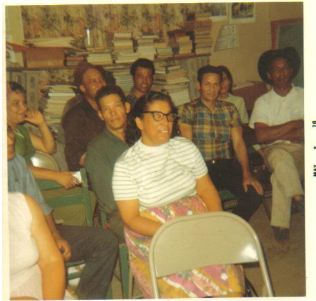
Figure 2.8 Meeting of parents and community leaders in Four Holes.

By the beginning of October, protestors in Ridgeville, which now included many USC students and South Carolina activists, frustrated with the lack of progress for Four Holes students, decided to take a more direct approach. Activists began gathering at the Four Holes School and then marching the three miles to Ridgeville Elementary School. After the third march on the school, sheriff's deputies stopped protestors almost as soon as they started, keeping them from entering Ridgeville. In early October, protestors decided they needed to take more vigorous action, and marched on the streets, entering school and city property. Authorities arrested all protesters. Coincidentally, NBC news reporters, who were in town to do a story on the Ridgeville boycott, caught the protest and arrest on camera. Reporters interviewed Reynolds and the story aired on the Huntley-Brinkley nightly news on October 3. ccxxvii Most of the arrested activists refused to pay their bail and spent several nights in jail. ccxxviii