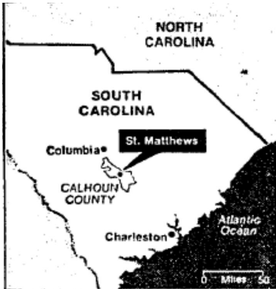
Figure 5.1 Map of Calhoun County

opportunities. As one young participant said, “Black folks got white folks all shaken up now. We can do this thing. All we got to do is stick together.” cdlviii