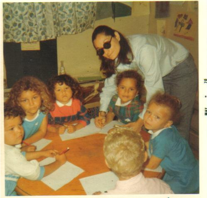
Figure 2.4 Young Four Holes Students at Freedom School