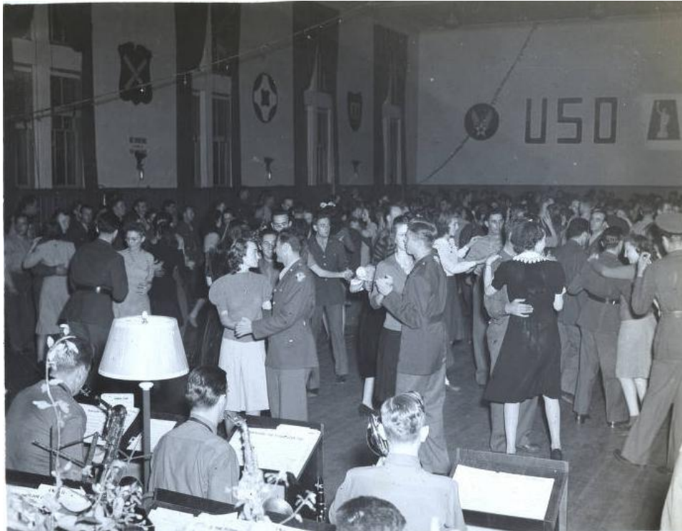
Figure 6.1 Scene from a USO dance. Women’s clubs recruited young women as dance partners for servicemen and worked closely with the USO to provide a variety of activities where men could meet young women.

according to the USO club, “a source of great satisfaction and enjoyment to the countless numbers of people who enter our club.” 85 The Dogwood Garden Club, which broke away from the Columbia Garden Club in 1936, also supported the morale-building movement by donating arrangements to the USO building. 86