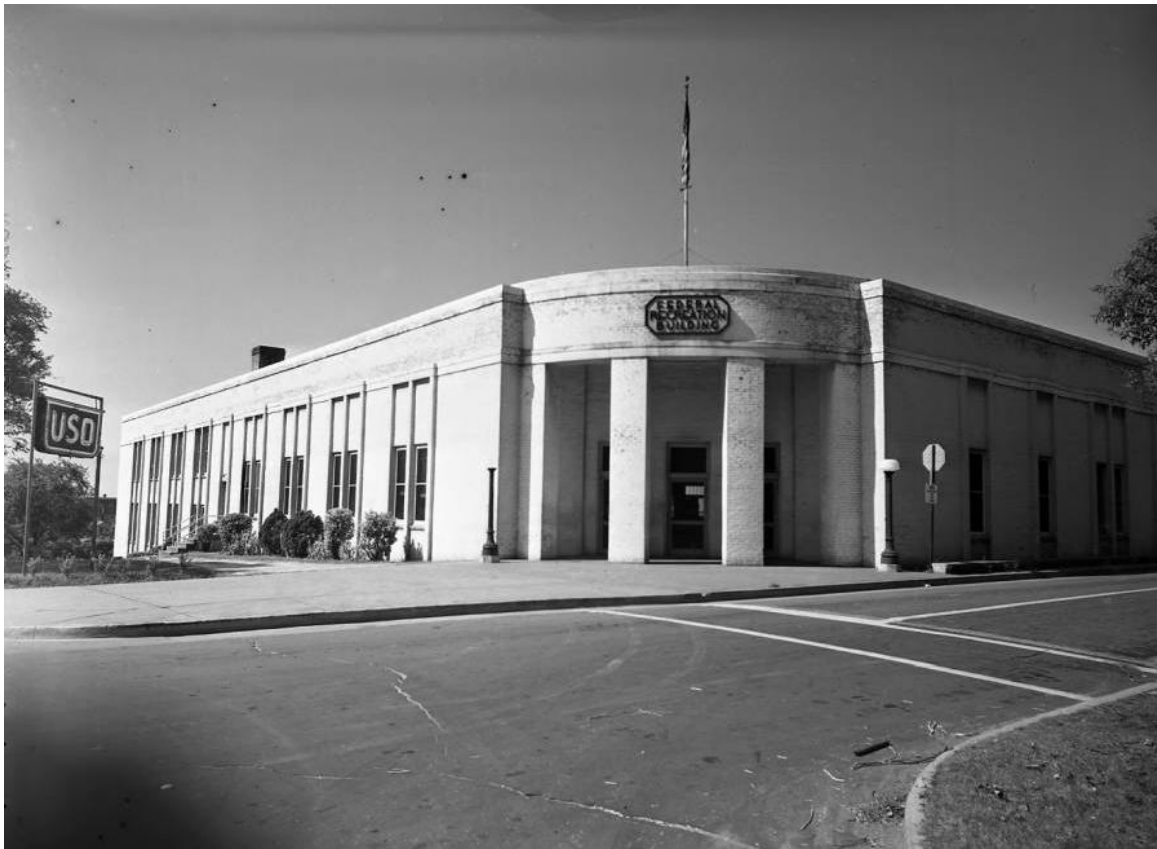
Figure 5.1 Federal Recreation Building. Built in 1942, the Laurel Street USO was the largest and most popular USO club in Columbia during World War II.

auditorium in the city, and a Traveler's Aid section that provided directions and information about recreation, travel, and housing. 71