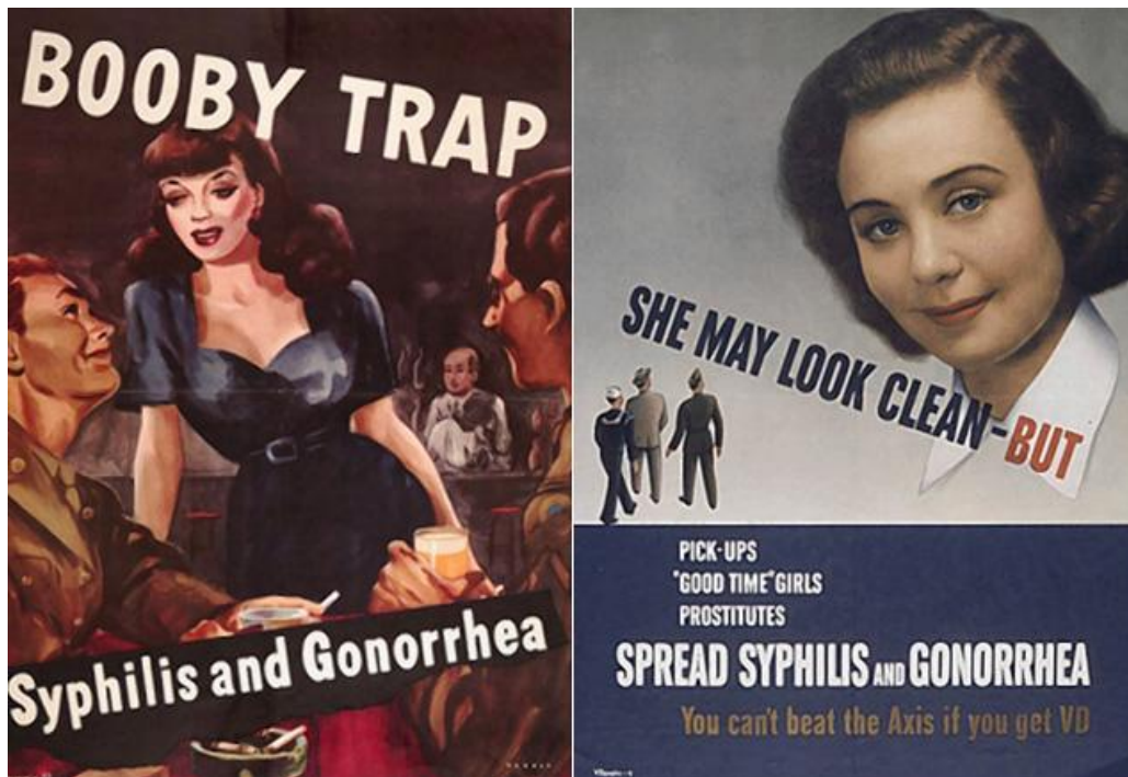
Figure 2.1 Anti-VD propaganda poster. The military launched a propaganda campaign to discourage servicemen from casual sex with loose women.

their actions were more harmful than they were helpful. The authors of the morale-building literature encouraged the interaction between local women and servicemen, but casual sex was not what they prescribed. As these non-professional women were harder to identify and prosecute, an alternative approach needed to be taken to protect the serviceman's health and the reputations of women who genuinely wanted to do their part. 26