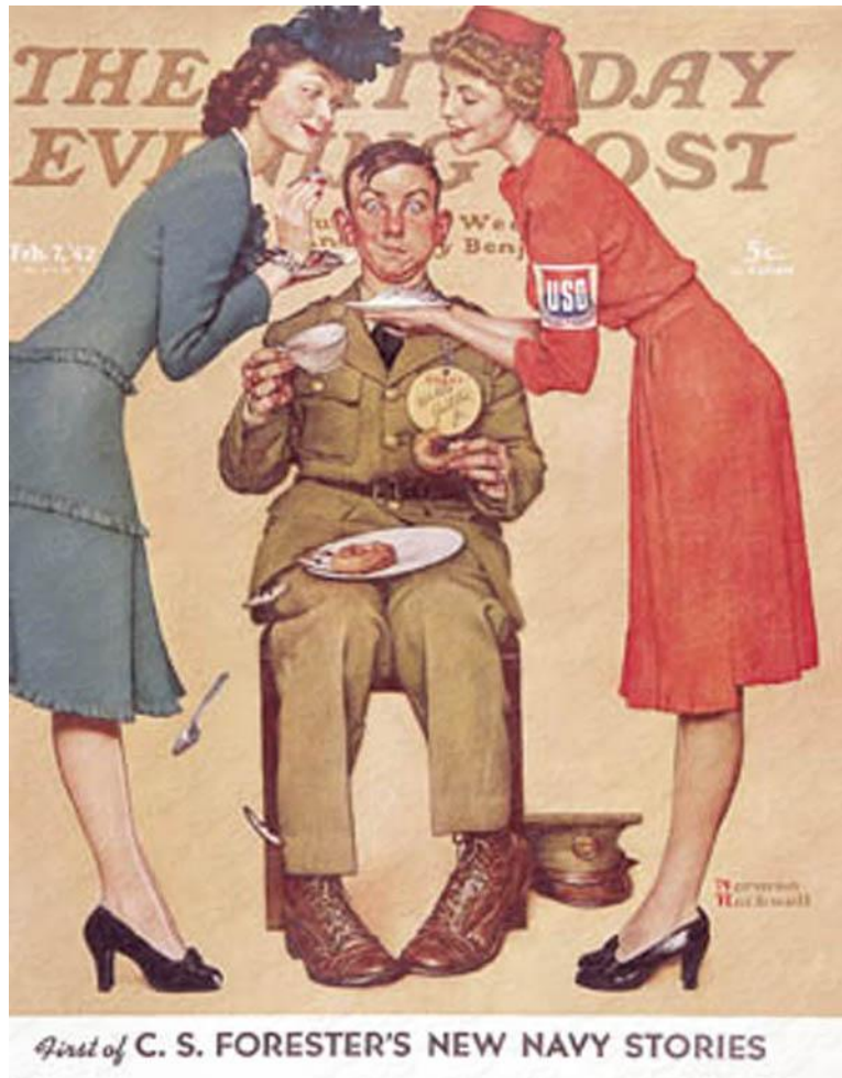
Figure 3.1 “Willie Gillis at the U.S.O.” Magazine images such as Norman Rockwell’s cover of The Saturday Evening Post illustrated the temptation of promiscuous women and the warm respectability of the USO.

protected soldiers from venereal disease but also helped them retain a sense of normalcy and humanity before leaving for the front. 40