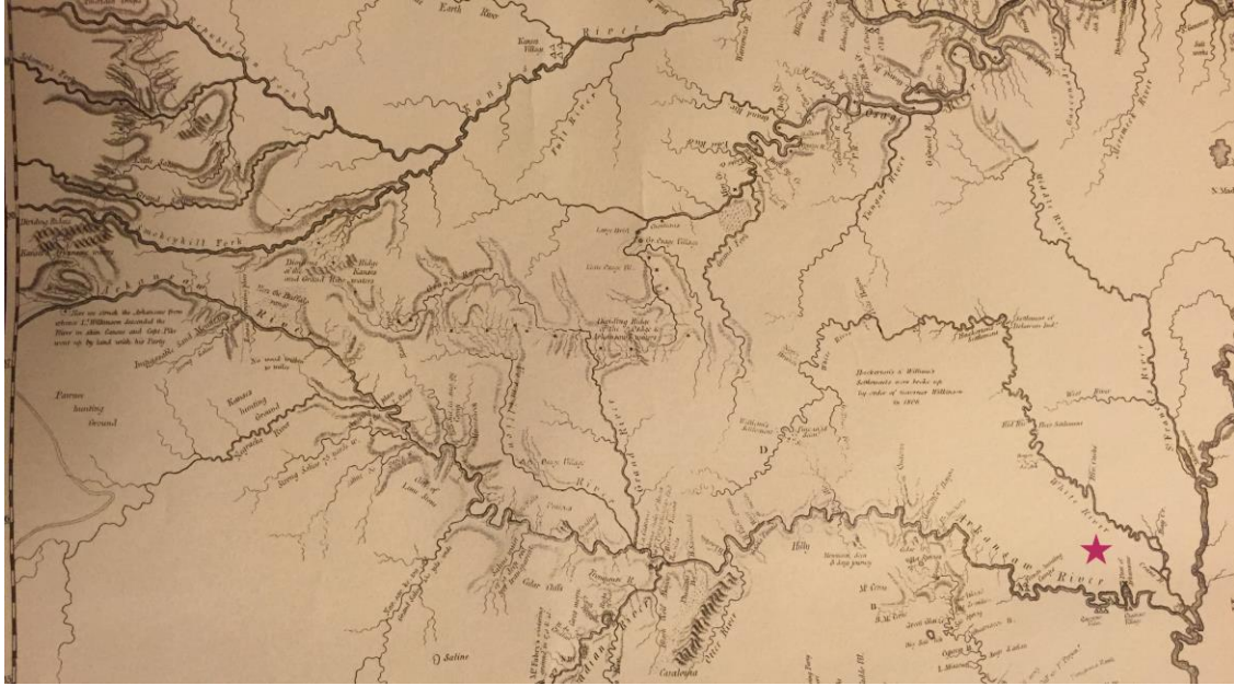
Figure 2.1 Zebulon Pike. The First Part of Cap't Pike's Chart of the Internal Part of Louisiana . Map. [ca 1:2,534,400]. Philadelphia: C. & A. Conrad, 1810. Zebulon Pike's map was one of the first American maps to offer detailed renderings of the Arkansas River Valley and its geography. While Pike's chart provided federal officials a better understanding of the waterways and settlements of the region, the geographical distortions of the region would not be corrected for over a decade. Descriptions of the imprecise quality of the 1824 Cherokee map suggest that it might have looked similar to Pike's depiction of the Arkansas Valley.

themselves into the growing cartographic representations of the Arkansas River Valley and asserted their own influence over settlement in the region. 133