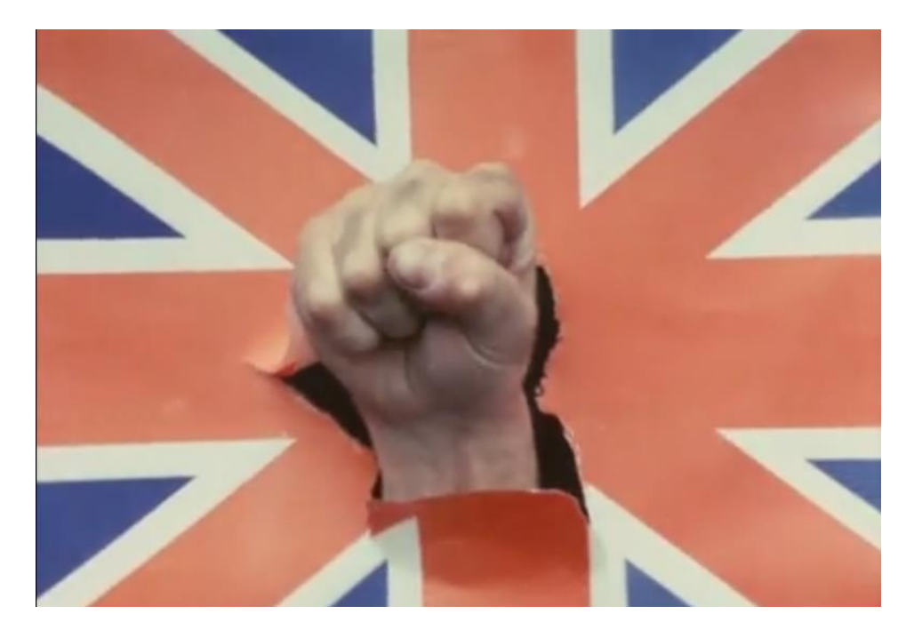
Figure 2.3. Fist breaks through the Union Jack in British Sounds

bourgeoisie creates a world in its image. Comrades, we must destroy that image." As a result, the destruction of the bourgeois image—along with the construction of a new image with accompanying sound—becomes the task of the film, and the audience must read the film with that in mind. This is crucial in understanding how the group portrays and interacts with reality because it cannot be within the traditional mode of bourgeois filmmaking. In this way, just as a fist breaks through the Union Jack following the voiceover (an image that will appear at the end of the film multiple times), the film suggests it will attempt a similar rupture with the images produced by Western imperialism and the relationship to audiences that capitalism determines.