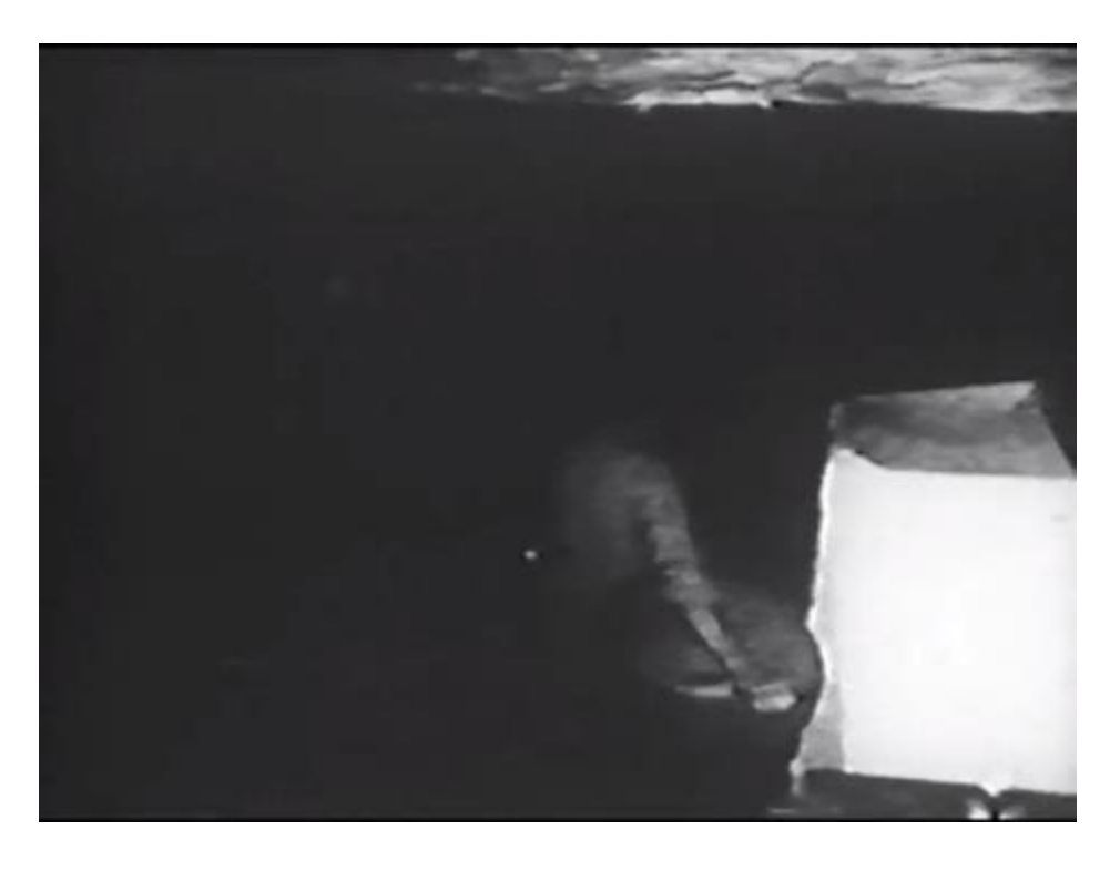
Figure 3.3. Woman begins her descent underground in People's War

It is the longest take in the film and leads to a number of sequences that remain silent and depict underground work of the local people. The shot achieves a more intimate connection with the subject being depicted and uses diegetic sound to create boundaries between underground and above. Despite being within a traditional mode of capturing reality, the shot and the proceeding sequences achieve this representation in a considerably more distinct way than their earlier films. If Newsreel's goal was to show "war films" depicting locals fighting against capitalism and imperialism, then the shots preceding this tunnel sequence are exactly that. And yet the focus is drawn away from that war and placed instead on a sphere that the outside world (and literal sound) cannot breach. The point here is not just that there is a difference in approach when the subject changes for Newsreel, but that this change is manifested in their aesthetic choices as well.