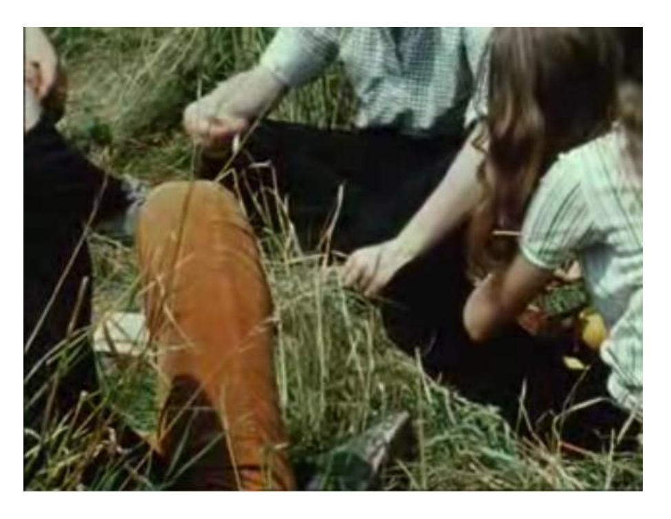
Figure 2.1. A typical shot of the students in Un Film comme les autres

Un Film comme les autres (A Film Like the Others, 1968) begins with a group of students and workers discussing the revolts of May '68 in a field—a sight that then gets periodically spliced with black and white shots of the actual events about which the students are talking. As the film unfolds, the viewer is struck by a number of elements that separate the film "from the others." The most startling and frustrating is that the audience only rarely and briefly gets to see the faces of those who are talking because the camera is focused either on their backs, their feet, or the grass around them, and the soundtrack is comprised (at many times) of multiple voices at the same time.