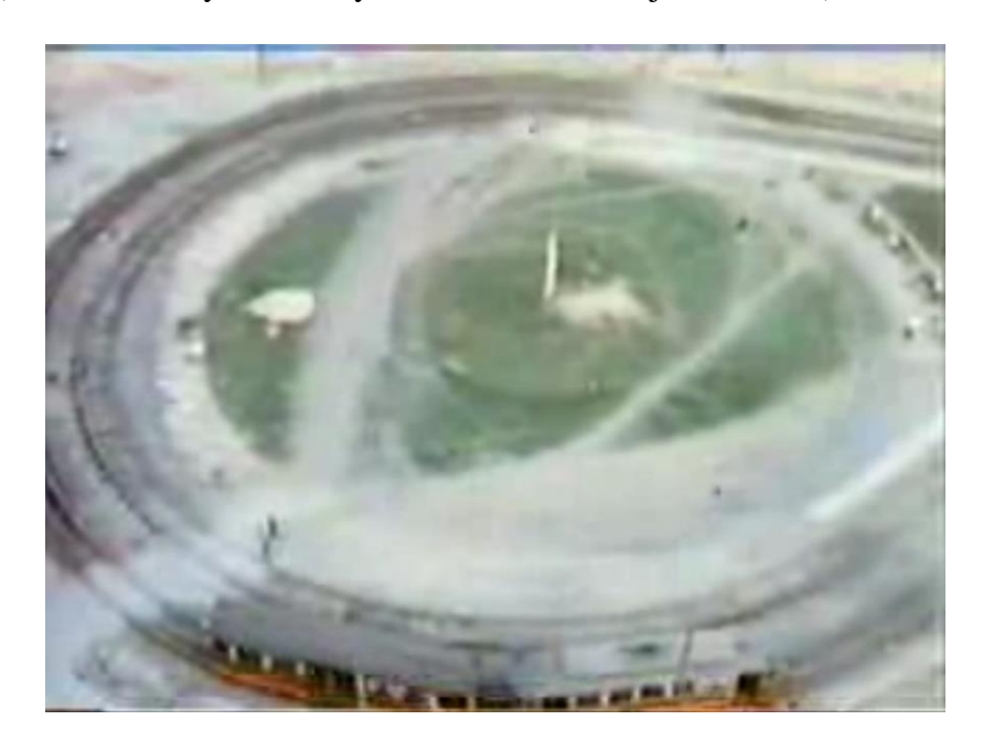
Figure 2.4. Crane shot in Pravda

As the conversation happens, the camera remains still during a crane shot of a circular dirt patch with a red trolley on it, as if to solidify both the omnipotence of the camera's sight as well as the inscrutable knowledge of the words being spoken. The red tram is worth noting in the context of the film, as there are repeated attempts to view other red objects (a rose on the ground or red wine being poured, for example) and "red" ideology in a way that seems correct to the commentary. Additionally, the shot can be seen as further awareness of the film's approach towards the Czech people as the distance from the ground would suggest an inability on the film's part to stand in for concrete social practices (and hence is symbolically distant from its subjects as well).<sup>12</sup>