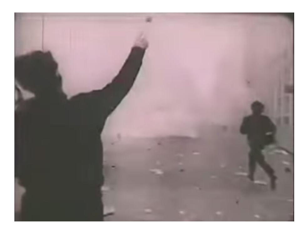
Figure 2.2. Still depicting the militancy and immediacy of Cinétracts 019

Cinétracts, a collection of short films created by a number of French directors including Godard, provides an interesting comparison to the films of the Dziga Vertov Group exactly because of the aesthetic similarities that it contains to the militant perspective of Newsreel.