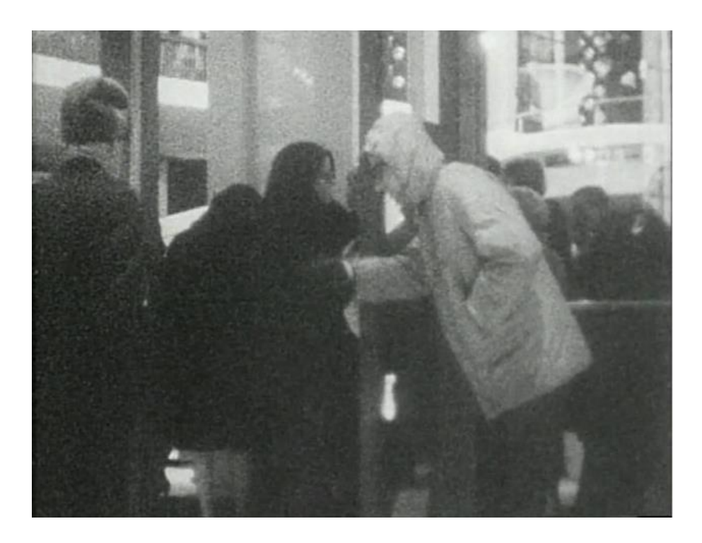
Figure 3.1. Patronizing guests as they enter Lincoln Center in Garbage

This moment can be said to foreground the stylistic norm of the Newsreel group in terms of aesthetics while also representing a key element of their collective motive—confronting the ruling class with the "garbage" of reality. The notion of "smearing" mirrors the militancy with which Newsreel sought to create their films, and "garbage" is doubly essential for both of its meanings: first as an object that is detested by bourgeois ideals and second as the refuse of society that exists on the fringe—the unaccounted for, a crucial part of Newsreel's films that I will return to in the concluding section. For now the focus remains on the representation of reality that Newsreel chose in the confrontations presented in their films.