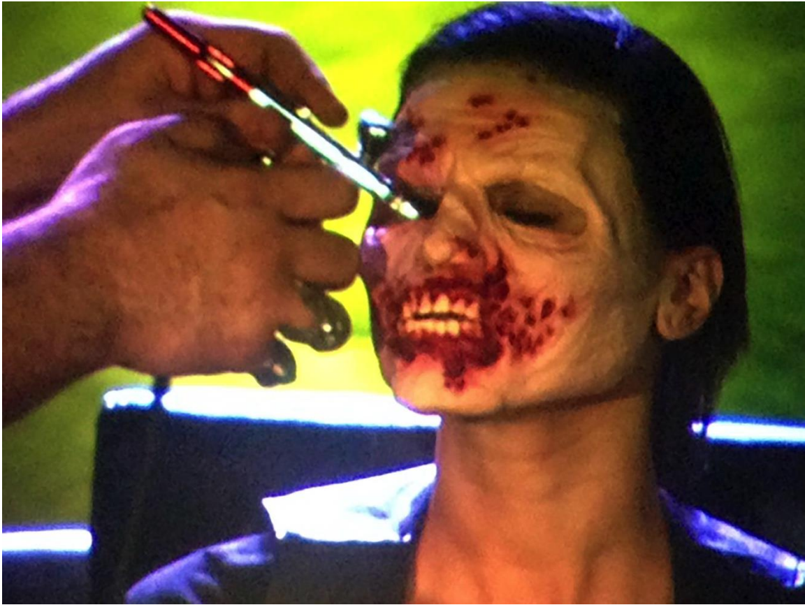
Figure 2. Zombie Mask. The application of a prosthetic and “wounding” process of an airbrush transforms this participant into a not-so-recent undead zombie.

As many of the zombie media shows progress, the walkers become more and more decomposed, less like people. We cannot seem to help ourselves and do not avert our gaze away from them; they are more decayed, their incomprehensibly working tattered limbs drive these creatures forward. The hungry jaws (if present) hang in a resilient scream. Clothes are optional, and for some, limbs are not necessary either to be an ever-present menace to the survivors in this media. Long before zombie media began its climb in popularity in the early 2000’s, Grossberg (1992) wrote about our desensitization when he spoke of horror films like Texas Chain Saw Massacre , which he said had become a “children’s story” where “reality is made up of