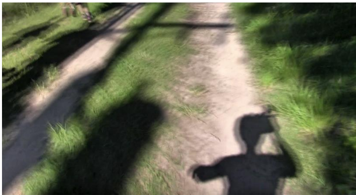
Figure 3. My shadow during the zombie run illustrates how the technology of my video camera becomes an extension of my body.