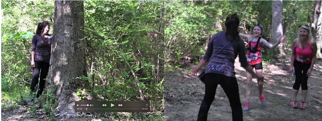
Figures 4, 5. Hiding zombie and zombie run slaughter. The first photo illustrates my position between the zombie and the runner. The second reveals how the runners’ preoccupation with the camera caused their “deaths.”

they were distracted by my presence (See Figures 4 and 5 ). We are distracted by the camera and the lens, since we are inundated with them every day with our cell phones, computer screens, and our narcissistic desire to see ourselves; we are subconsciously drawn to the camera.