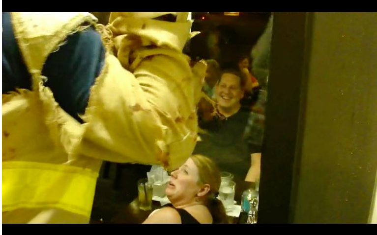
Figure 11. Spectator fear at Atlanta zombie walk.