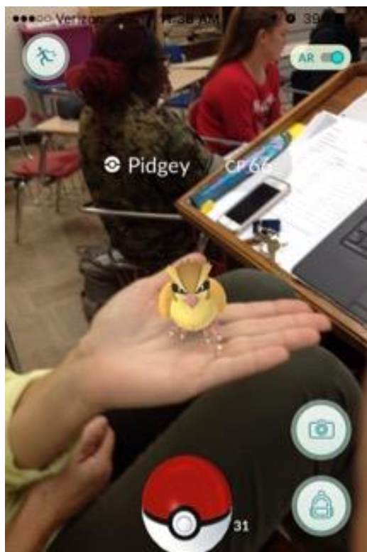
Figure 1. Pokemon Go Pidgey. This photo illustrates how students infiltrate the schoolroom with their own pop culture. The Pokemon Go character rests in my hand, invisible to me but not the student.

tasks in the classroom, and they now have laptops and cell phones at their disposal, it only seems common sense that we, as educators, should tap into that which they are already immersed. For example, I spent the first three weeks of school this year trying to figure out what my students were so intently searching for under my desks, behind cabinets, and up and down the halls. They would get so excited when they found what they were looking for! When they finally showed me, I discovered that I had little Pokemon characters hiding in my room and throughout the hallways at in our building. Their cell phones used the camera function to incorporate the