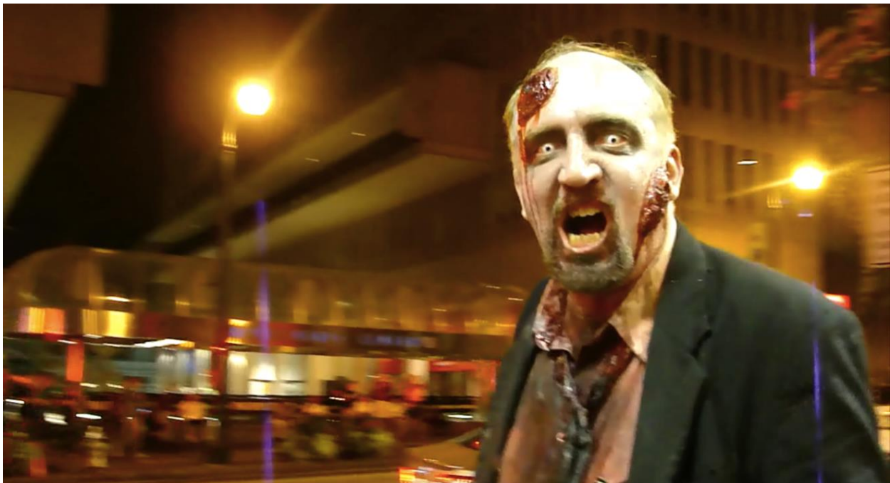
Figure 10. Zombie businessman illustrates silent scream during Atlanta zombie walk.

meticulously designed this appearance for a realistic effect that as I slowed down for the video, became even more realistic in. He wears contacts that make his eyes appear dead, yet wide open in their glare, and he approaches the camera in a self-imposed close up to heighten our anxiety at his proximity. As he approaches the camera, we can see that he has two oozing wounds on his head, one on his forehead and the other on his cheek. While he accomplishes through makeup and a prosthetic wounding attached to his face, this makeup (especially in the darkness of the