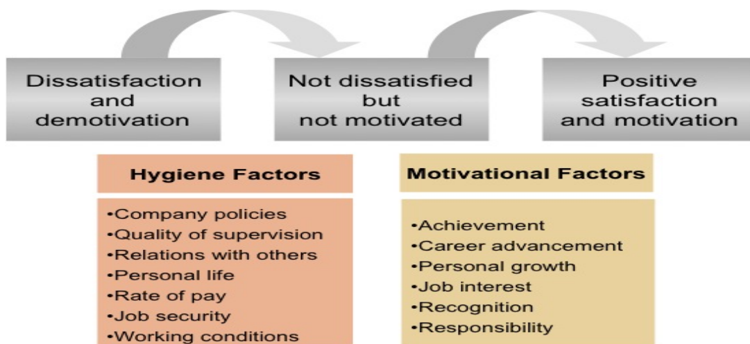
Table 3 shows Herzberg's Two Factor Approach