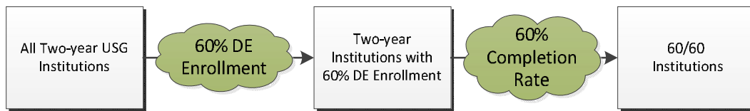
Figure 2. Methodology for identifying two-year institutions for Phase II of the research study.

database at the USG central office. These data are a matter of public and were requested from the USG Vice Chancellor of Research. Once obtained, data were analyzed in a method similar to the procedure used to identify the institutions satisfying the first criteria. The number of students who successfully completed remediation was divided into the total number of students enrolled in remediation for each institution. This simple mathematical formula established the overall percentage of completion.