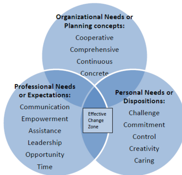
Figure 2.2. Adapted from Polka’s Effective Change Zone (2007). The figure illustrates the high-touch personnel needs when implementing sustainable change.

This is supported by Blankstein (2004), who stated that the most difficult part of change in schools involves the human aspect. Polka (2007, 2010) conducted extensive research, concluding that implementing sustainable change requires leaders to operate in the effective change zone, represented in Figure 2.2 below, where the needs of the organization, professional needs of the individual, and personal needs of the individual overlap. The human side of change is within the effective change zone. The leader must develop positive relationships with stakeholders in order to implement change.