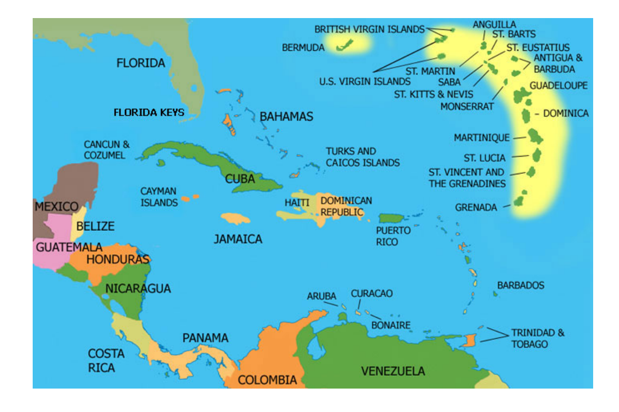
Figure 1. Map of Jamaica within the Caribbean.

The island was a British colony from 1655 until 1962 when it won independence. As a result of this colonial history, Jamaica is an English-speaking island with Standard Jamaican English (SJE) as the official language, and Jamaican Creole (JC) as a recognized language spoken by the majority. Jamaican Creole was birthed out of the brutal contact situation between Europe and Africa within the context of the plantation economies of the West Indies. On the one hand, there were the languages of the different West African groups brought over to Jamaica via the slave trade. The most prominent language group that survived the sea passage was Twi (Alleyne, 1988). On the other hand, the white fortune seekers who came across from Britain spoke different dialects of