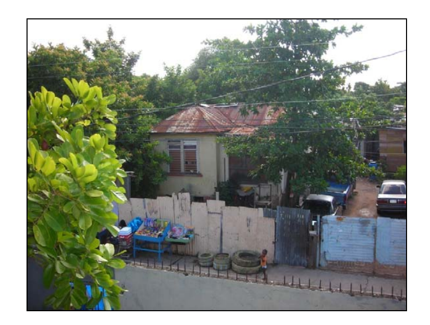
Figure 6. Community surrounding St. Alphonso Primary School.

St. Alphonso Primary School is a Roman Catholic school which receives government support in the form of salaries, and money for the maintenance of school buildings. It was established in 1967, five years after Jamaica received independence from Great Britain. The school is located near a major main road which is strewn with potholes and many small shops selling basic dry goods (such as tin/canned foods, flour, and rice). This main street is also populated with bars, houses, and unused business buildings. One has to turn off from the main road onto a smaller road to get to St. Alphonso Primary School. Located on this narrow road are the school compound, and rows of homes in need of fresh paint and other repairs. Residents who live at the top of this small road often have feuds with persons who live at the bottom of the road because of disputes between young men over turf. Some of the vendors that sell food at the gate of the school reside in the homes along this lane.