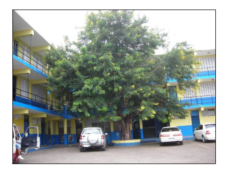
Figure 11. Inside Bedford Primary School. Grade 5 block on third floor (top left corner).

As you enter Bedford Primary you come across a tall gate with high walls on which are painted the school crest and motto. If the gate is closed with a chained padlock, then an old gentleman will open it for you. From the gate you make a beeline straight to the office, past the very tall Shower of Gold tree. Similar to St. Alphonso the school yard is an asphalted quadrangle where the children play and have school devotions. There are three sets of buildings, all painted in yellow and blue forming a Ushape. Two buildings are three stories high and house the school's office and bathrooms on the first floor, and the classrooms on the second and third floors. The grade five classes like most of the upper elementary grades are located on the third floor. Opposite the grade five block is a set of one storey buildings which include the library, guidance counseling room, kitchen, drama room and canteen. Each morning, during data collection, I would enter the office and sign a visitor's log book and take a visitor number tag in keeping with what the principal of Bedford Primary had requested of me.