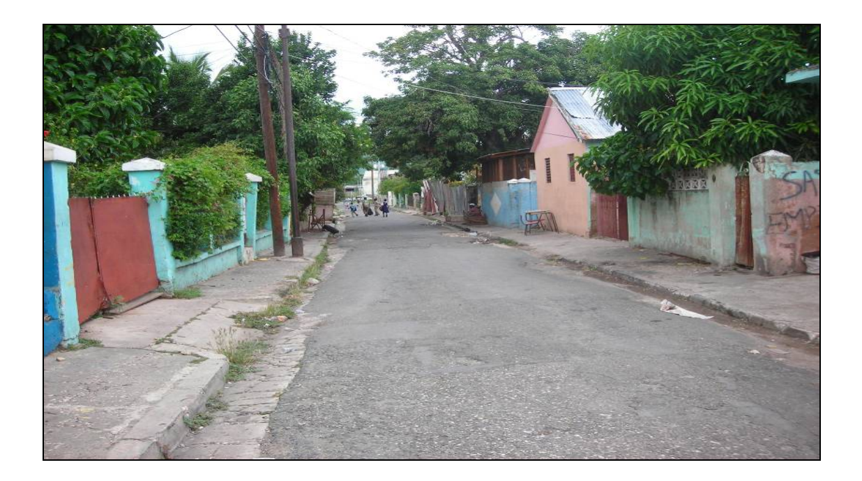
Figure 10. Community surrounding Bedford Primary School.

Bedford Primary School is a government school which was established in 1921,<sup>38</sup> forty-one years before Jamaica's Independence. The school is situated near two main roads where government buildings and one of the more prominent private (preparatory) schools are located. Yet, despite its close location to these government buildings, the immediate environment largely consists of residential houses in need of paint and repair with overgrown lawns. The streets that surround the school (see below) are as narrow as lanes and are actually one way streets; only one car can pass at a time. Right outside the school's gate are the vendors that sell bag juice<sup>39</sup>, cheese snacks, other food items and toys to the school children during lunch time.