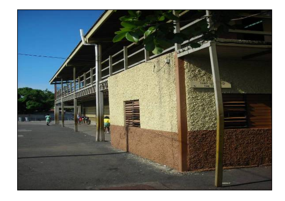
Figure 7. Grade 5 block (second floor) at St. Alphonso Primary School.

As you enter St. Alphonso Primary School you come across the first quadrangle and see the Roman Catholic Church of the same name, and the kindergarten. After leaving this first quadrangle you then enter through a narrow gate and come to the second quadrangle. A set of two story blue buildings which house classrooms, the school's canteen, library, teachers' lounge, and a stage are all located in this area. Further down past a huge tree there is another set of two-story buildings, this time painted in brown. This building houses the office, the computer room, the reading resource room and a few other lower grade classes on the bottom floor. On the second floor are the grade four and five classrooms.