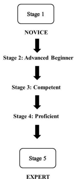
Figure 1: Benner’s (1984) Theory of Novice to Expert: stages of progression for new nurses in clinical nursing practice

Benner studied the applicability of this model to nursing practice. Her US-based research involved novice nurses, experienced (having at least five years of clinical experience) nurse clinicians, and senior nursing students, in six hospitals. Individual and group interviews, in addition to participant observations in the hospitals’ clinical settings, were conducted. Through the analysis of her research findings, and following the Dreyfus model, Benner concluded that it was “possible to describe the performance characteristics at each level of development and to identify, in general terms, the teaching/learning needs at each level” (Benner, 1984, p.20). As displayed in Figure 1, Benner’s model consists of the same five stages of progression found in the Dreyfus model (noted above). Each stage builds on the previous one, with respect to the ongoing acquisition of clinical skills, and, to the continuing integration and application of theory to practice.