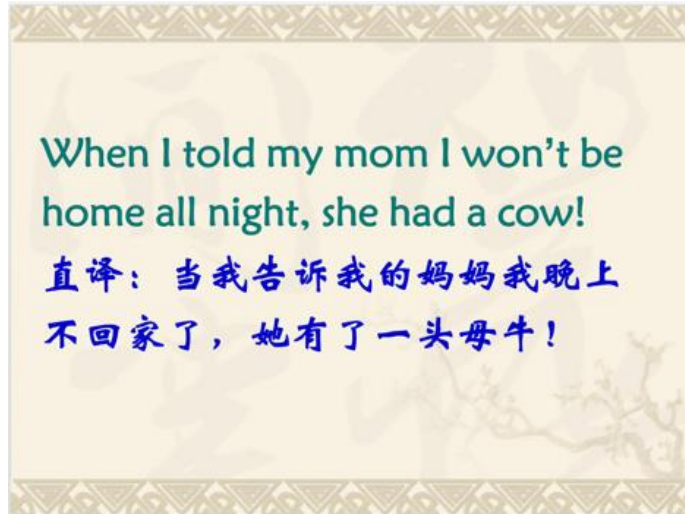
Figure 1: Slides from Ms. Liu's Slides: An Interesting Mistake Made in Translation.