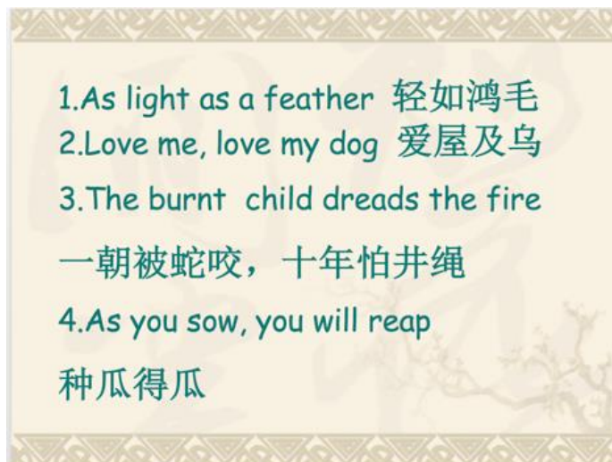
Figure 2: Slides from Ms. Liu's Slides: Translations of Classic Chinese Idioms and Proverbs.

In this class, Ms. Liu spent most time sharing out-of-textbook stories with students that were meaningfully connected to students' daily life. For example, Ms. Liu shared with students the story of how Chinese translation (i.e., “可口可乐”) of the beverage, “Coca