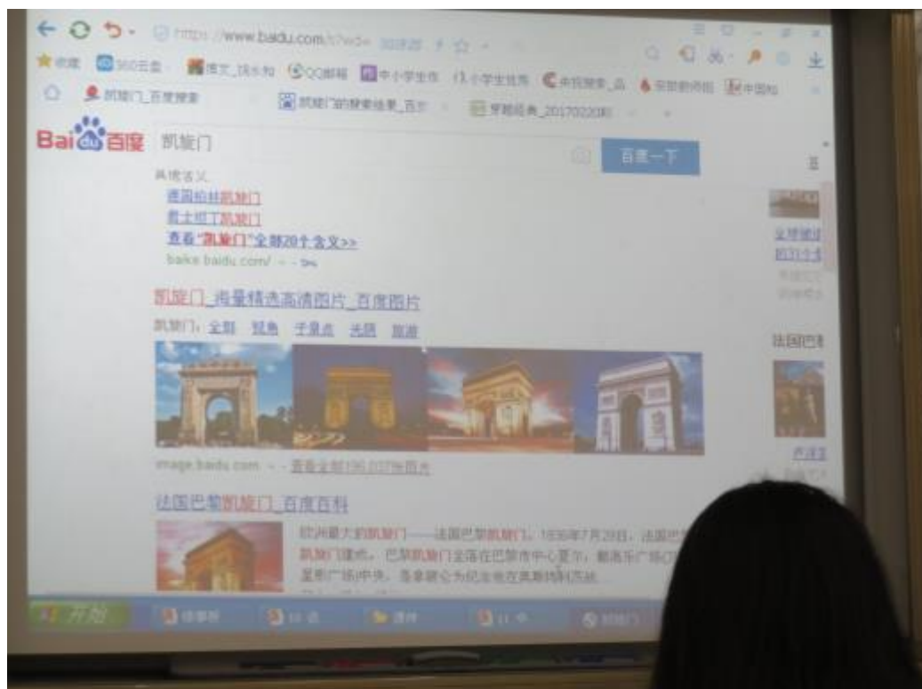
Figure 6: Ms. Liu's Use of Internet to Show Pictures of the Triumphal Arch in Paris.

commented in the interview that she had access to the Internet but did not use it very often. She shared that she asked students to search information through their personal cellphones if the Internet cord did not work. As observed, without wireless internet, Ms. Liu had to use her personal cellphone plan to access the Internet. In addition, Ms. Liu shared that she seldom asked students to submit assignments through the Internet. Observational data in her classes revealed that though she presented digital products (e.g., PowerPoint slides) to students very often, Ms. Liu did not encourage her students to use technological devices (e.g., computers) to create new media products.