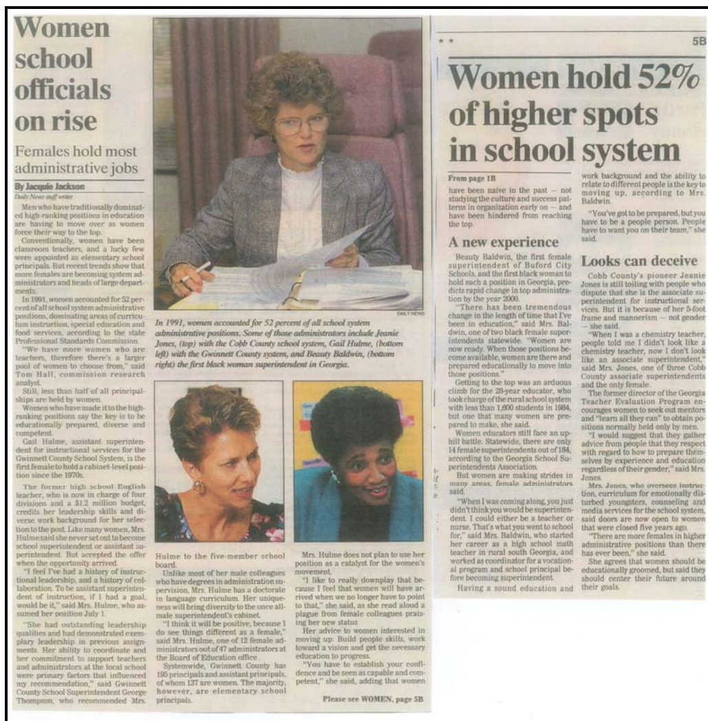
Figure 2: Women School Officials on Rise, Atlanta Journal and Constitution , Date Unknown.