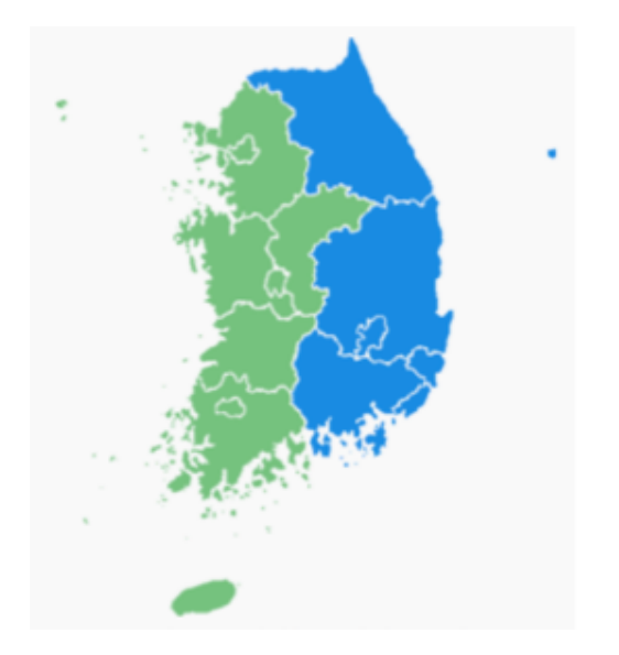
Figure 2.1. Presidential election results in 2002. 18

election results often turn into overheated political disputes; this division affects overall political decisions in South Korea.