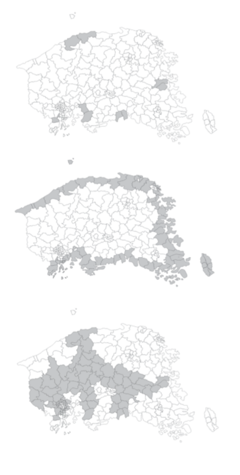
Figure 4.1. Internal border region: "Internal border" variable on the map.

Figure 4.2. Coastal location: "Coast" variable on the map.