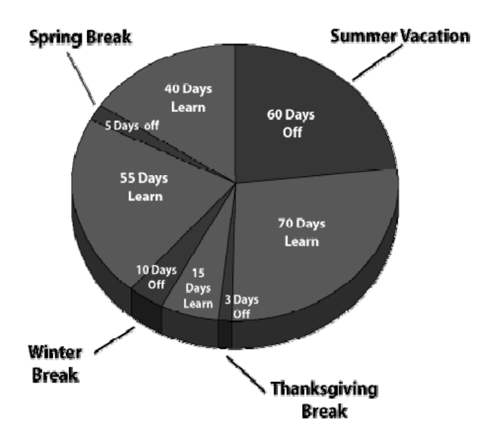
Figure 1. Conceptualization of the Traditional Calendar