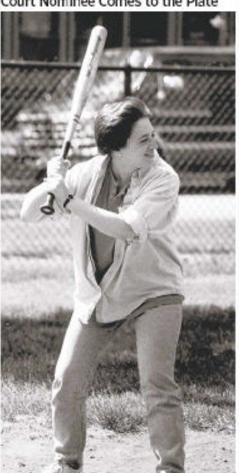
Elena Kagan, shown in 1993, was nominated Monday to the Supreme Court. She drew naves from Democrats, concerns from Republicans. Ad-