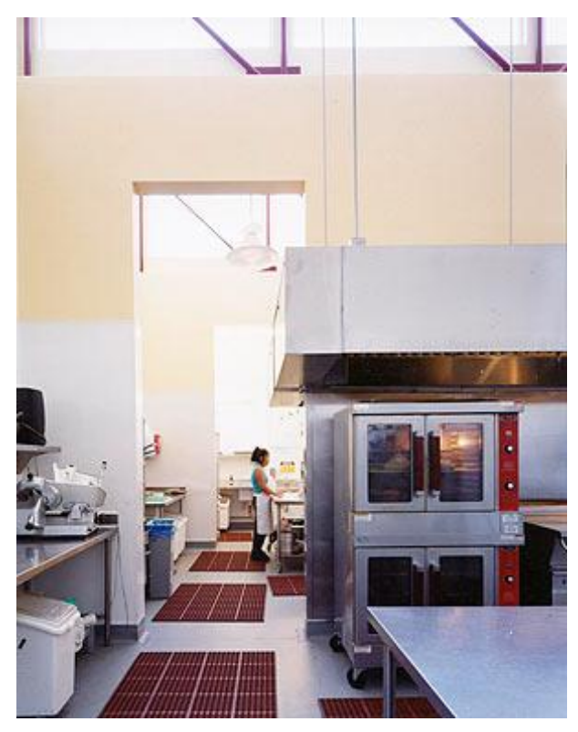
Figure 1 - Incubator Kitchen interior at La Cocina, San Francisco

Incubator Kitchens are an economic development model gaining in recognition nationwide as their success in growing small businesses is proven. Their most basic function is to provide affordable access to a commercial kitchen that is certified to meet all food safety regulations, allowing entrepreneurs to develop a culinary business without taking on the costs involved in developing a