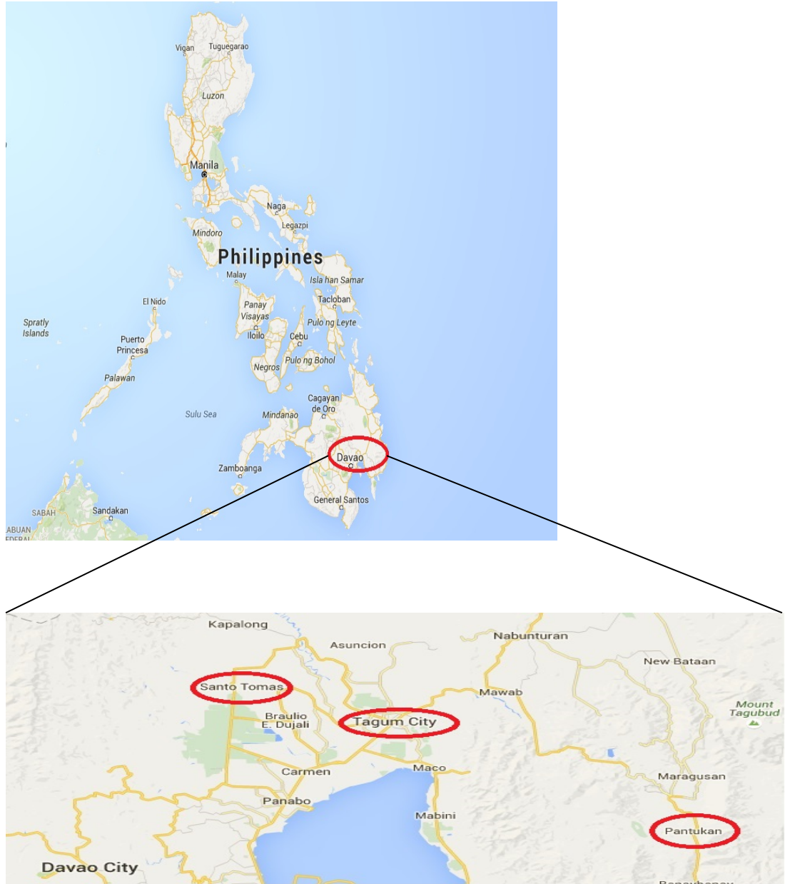
Figure 2.1: The Field Site