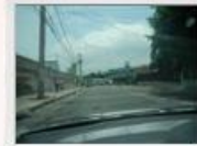
Rolling through Kingston