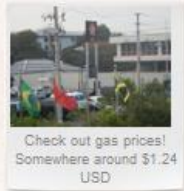
Check out gas prices! Somewhere around $1.24 USD