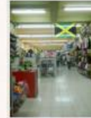
Inside the Azan Supercenter. It's Jamaica's 50th anniversary of independence so there are flags everywhere!