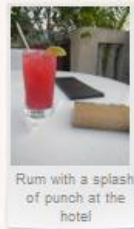
Rum with a splash of punch at the hotel