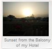
Sunset from the Balcony of my Hotel