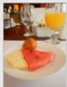
First breakfast and first johnnycake! Yum!

Posted on June 30, 2012 by angelamannobba Edit