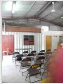
Support Group Meeting at the YMCA - Shipping Containers

Posted on July 5, 2012 by angelamannboba Edit