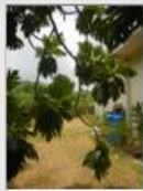
Jamaican backyard AKA I'm a tourist

Off to my very first interview for now though. I'm a little nervous! Wish me luck, man!