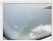
Maybe over Ocho Rios?

Arriving at my layover in Miami and awaiting my flight to Kingston continued to be interesting. As passengers began to fill the gate, I gazed around at who I would be arriving with. I was excited to see what appeared to be a great many deaf individuals at first glance. I thought to myself that it was quite a coincidence a large deaf population was traveling on my same flight to Kingston. Turns out they were just very expressive and communicated a great deal using their hands! (ha! probably could have used some more coffee.) In any case, it was a good first introduction to the culture. As I'm preparing to board, 3 policeman circle a beautiful woman with her child and ask her to come with them to pay for an item she had allegedly shoplifted at a store down the terminal.