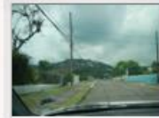
View from a neighborhood in Kingston