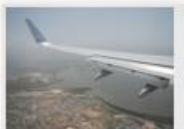
Over Kingston Harbor Preparing to Land

As I leave the airport to catch my JUTA taxi to the hotel, smells of curry and who knows what else permeate the exit from the Manley airport. Turns out there are jerk and curry stands and a Red Stripe bar (hollah!) directly outside the airport! I didn't stop for fear of getting a little too tipsy to adequately find my way to my new home, but there are already plans to hit it up on my way out.