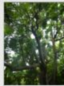
Beautiful old mango tree in the backyard of Kathy's aunt's house