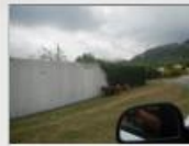
Goats being herded down the road!