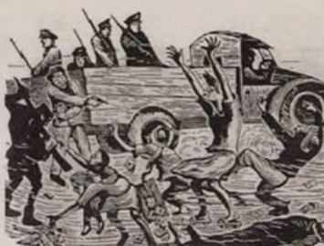
圖 9-7 黃榮燦的木刻版畫〈恐怖的檢查〉鮮活地描繪了二二八事件情景，發表於民國36年4月28日的上海《文匯報》。黃榮燦本人也死於1950年代的白色恐怖。