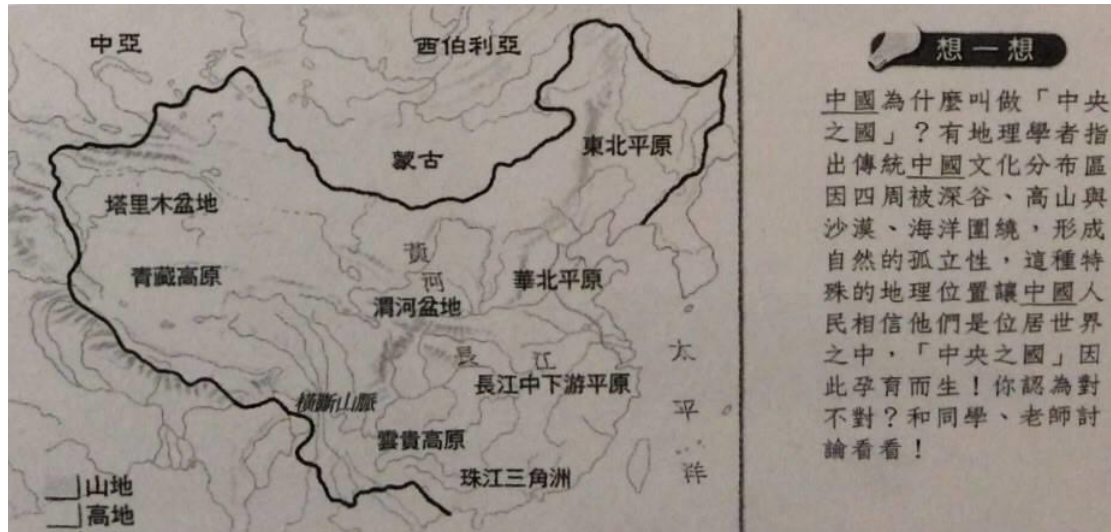
Figure 6.3 The domain of China.

This is the content of the textbooks of the 89 th -year edition. In this edition, ‘China’ has its meaning as the cultural and political community of the territory of mainland China, ruled by its government – the P.R.C.. (Nan-yi II, 2003: 9)