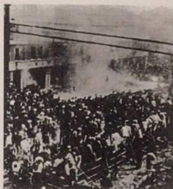
圖 9-6 二二八當天，臺北專賣局前聚集之民眾。

事件初期，群眾毆辱外省人，死傷估計約千餘人。而後期的鎮壓與清鄉，臺灣人死難者合理的估計應在萬人以上，其中包括許多社會菁英。民國35年來臺任職，後來曾任經濟部次長的 汪彝定 在回憶錄中見證他所經歷過的二二八事件，提到與 陳儀 的一席談話：「我們應該公平的說，這只是一次臺灣人發洩不平的意外事件，不是以外省人為目標的暴動。」最後並如此感慨：「我今天追述這一段往事時，胸懷沉痛。臺灣已是我的故鄉……但這裡的族群分裂，卻將像我這樣熱愛這片土地、這些人民，而且對大陸根本早無認同感情的「外省人」，置於一種特殊環境下，而這個環境，到我孫兒女時或許才會消失。」（資料來源： 汪彝定 ，《走過關鍵年代——汪彝定回憶錄》）