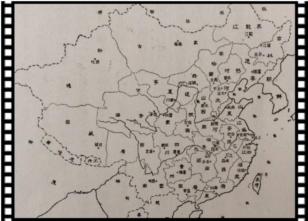
Figure 6.1 The map of China

This map shows the domain of the R.O.C. state. The idea of one ‘Chinese nation-state’ lasted for almost 30 years in Taiwan from 1949. (1955: 63)