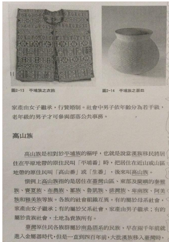
Figure 6.2 The indigenous people's clothes and bowl.

The Taiwan locally-oriented culture and people started to be introduced as the ethnic origin of 'Taiwanese'. ( Knowing Taiwan [History] , 2002: 12)