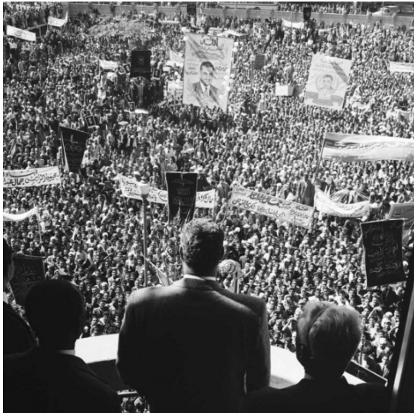
Illustration 4: Nasser giving a speech to the Egyptian people declaring the political merger of Syria and Egypt into the United Arab Republic, February 1, 1958. Courtesy of the Library of Alexandria photo archives, photo taken February 1, 1958.