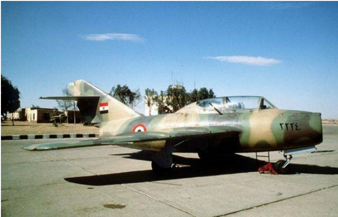
Illustration 3: Russian designed and built, MIG-15 fighter jets were state of the art aircraft at the time of the Czech arms deal. Seen above is an Egyptian Air Force MIG-15 parked on a runway in 1981.