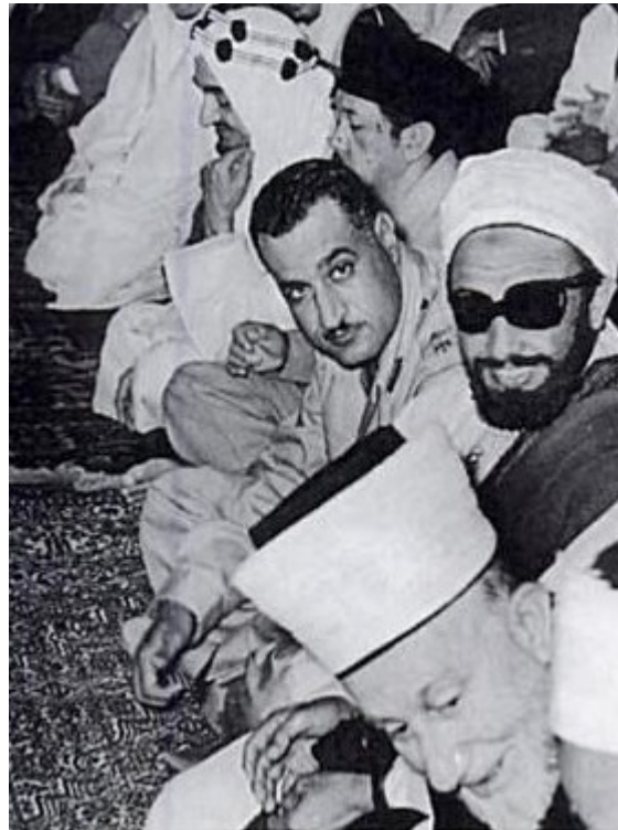
Illustration 2: Nasser photographed at the Bandung Conference surrounded by other Middle Eastern heads of state. By the end of the conference, Nasser had become an international leader of the Non-Aligned movement (from Said's Nasser , page 154).