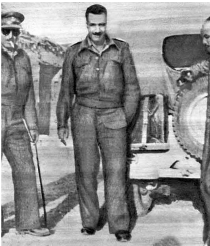
Illustration 1: Field Marshal Gamal Abdel Nasser witnessed the poor quality of Egyptian military equipment while serving in Fallujah, Iraq, December 1, 1948. photo taken December 1, 1948.