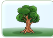
Centering & Grounding