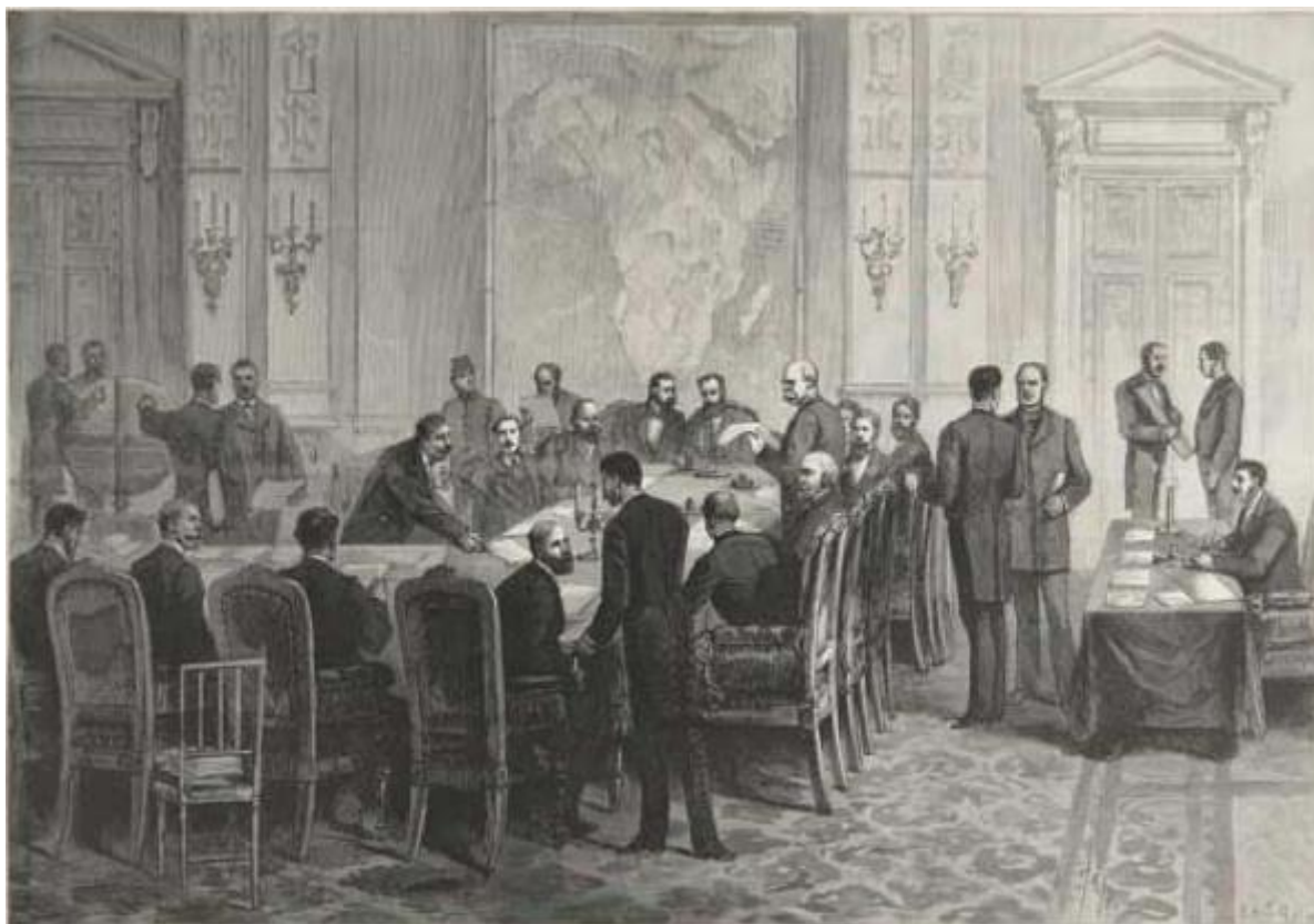
Figure 4. Berlin Conference (with map of Africa in the conference hall)

Wikicommons Public Domain; [online] available at: