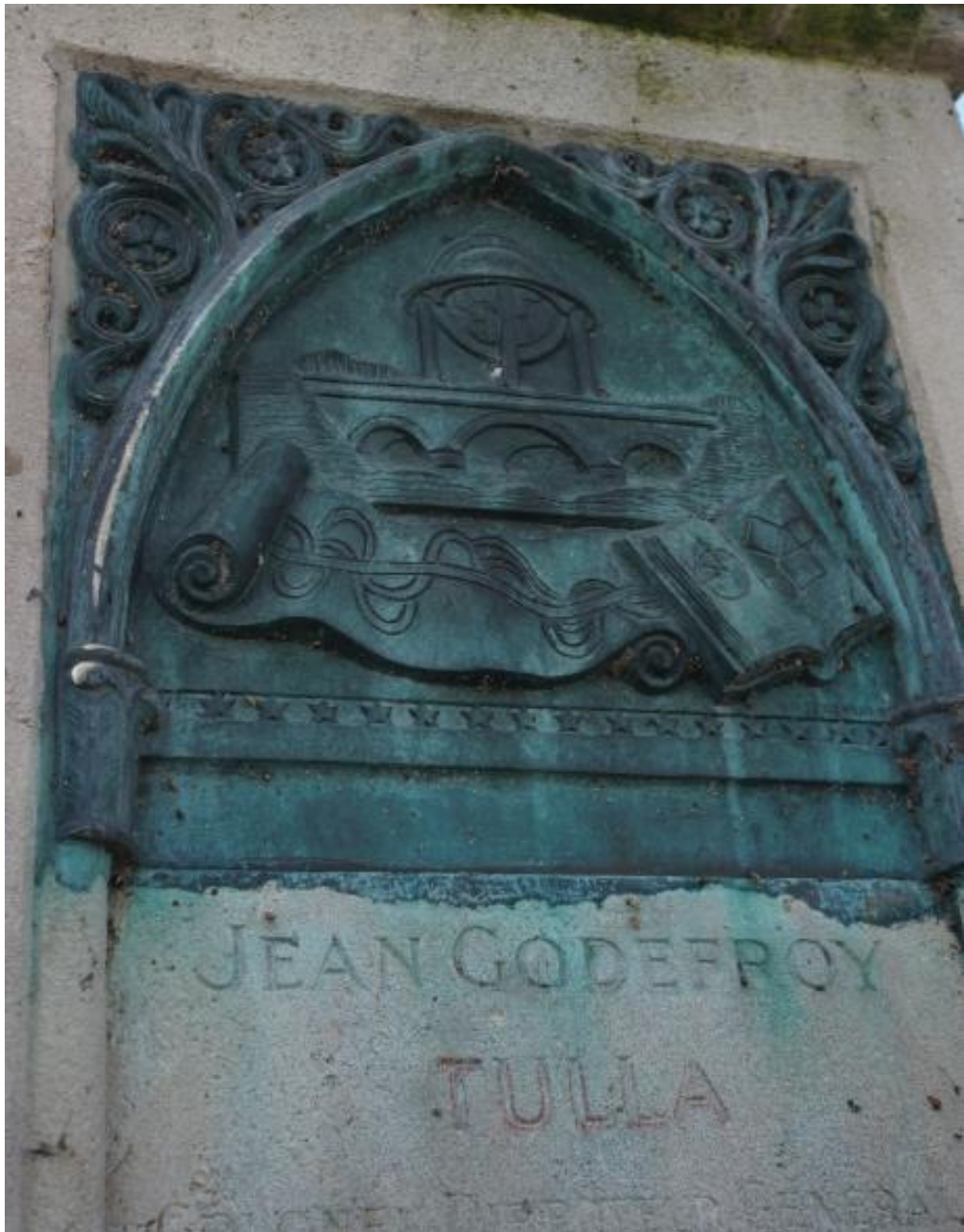
Figure 2. Johann Tulla's Tombstone in Montmartre Cemetery, Paris