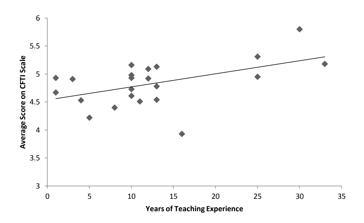
Figure 1: Scatterplot showing the strong positive relationship between teachers' reported years of teaching experience and overall average score on the CFTI.